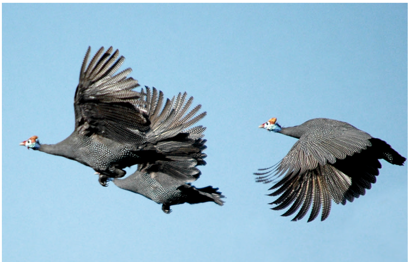
Fig. 1: Helmeted Guineafowl, Numida meleagris.