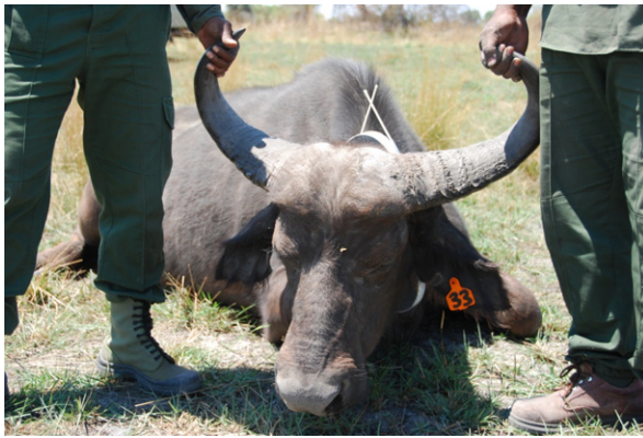
Fig 2 Photograph of a collared adult female buffalo from Mahango National Park in Namibia, with highly visible ear tag containing a unique identifier

Botswana into Khaudom National Park, which retains a tiny remnant buffalo population. From there, the animals split into two groups, with one group spotted in Angola near the Kavango river, around 250 km from where they had been ear-tagged (Fig. 1, white dashed line). Another ear-tagged animal was eventually shot in an agricultural area in the Otjozondjupa Region in central Namibia (Fig. 1, grey dashed line). This location was a staggering 500 km from where she was tagged, far outside what is considered current buffalo range in Namibia.