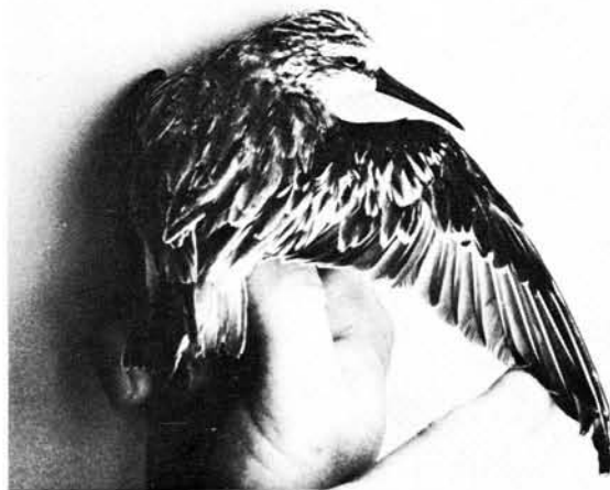
Plate 6. Another dorsal view of Sandwich Harbour specimen, note head markings.