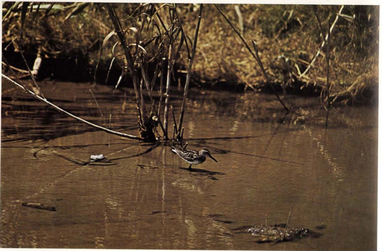
Plate 2. Broad-billed Sandpiper in breeding plumage, Swakopmund Sept. 1973.