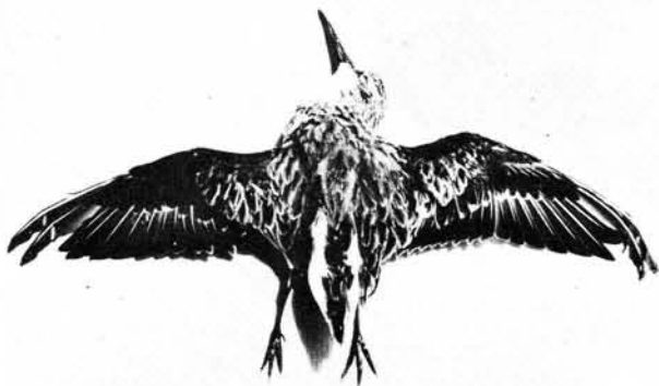
Plate 5. Dorsal view of Sandwich Harbour specimen of L. falcinellus , note dark rump and tail center.