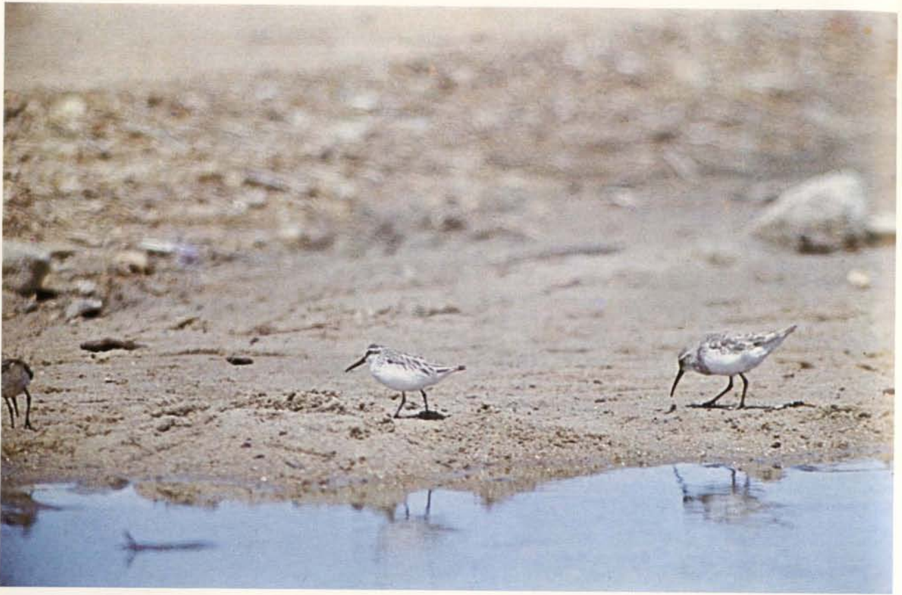
Plate 1. Broad-billed Sandpiper in non-breeding plumage, with Curlew Sandpiper at right, Swakopmund Jan. 1965.