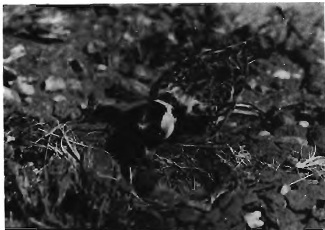
Fig. 9. A male Eremopterix verticalis feeds Hodoterines mossambica to a small chick.