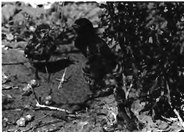
Fig. 17. The male Eremopterix australis stands by as the female runs to and from the nest in an attempt to get the second chick to leave the nest; the first chick is preparing to follow the parents, while the second chick just continues to beg at increasingly higher intensity.