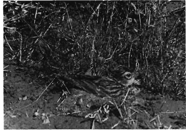
Fig. 4. Alauda starki incubating. The extreme crypsis of the sitting bird is well illustrated.