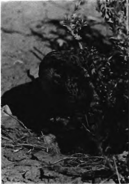
Fig. 11. Chersomanes albofasciata feeding a chick: note how deeply the parent's bill is inserted into the chick's throat.