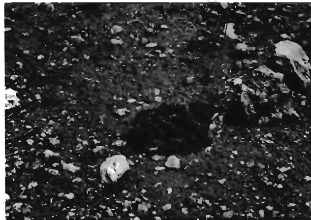
Fig. 18. A fledging Chersomanes albofasciata chick that has recently left the nest.