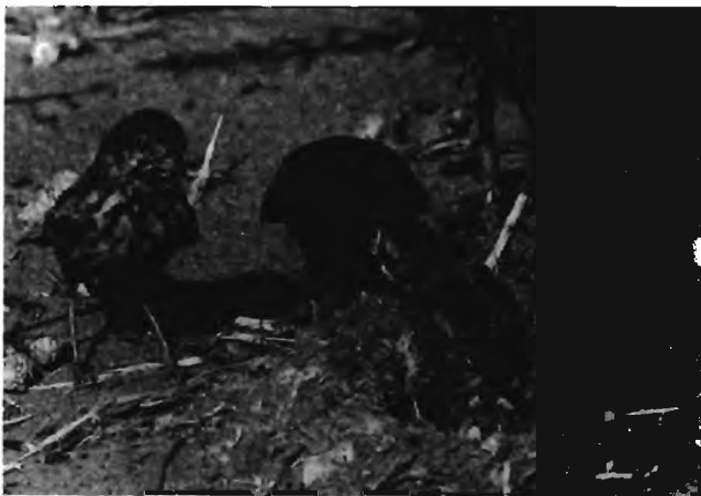
Fig. 13. A male Eremopterix australis feeds a chick as the female stands anxiously by; her anxiety is shown by the depressed plumage.