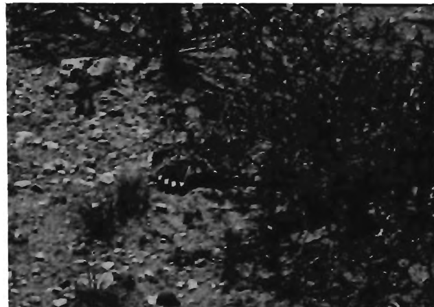
Fig. 20. The distraction display of Chersomanes albofasciata near its nest with eggs. The bold tail pattern stands out well, while the cryptically coloured body plumage merges in with the background.