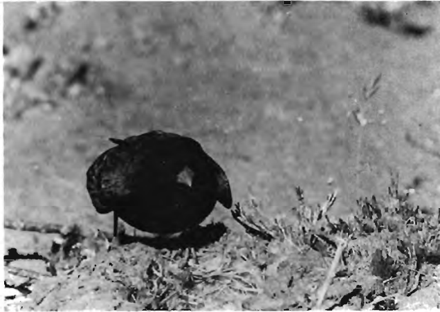
Fig. 3. A male Eremopterix australis about to incubate.