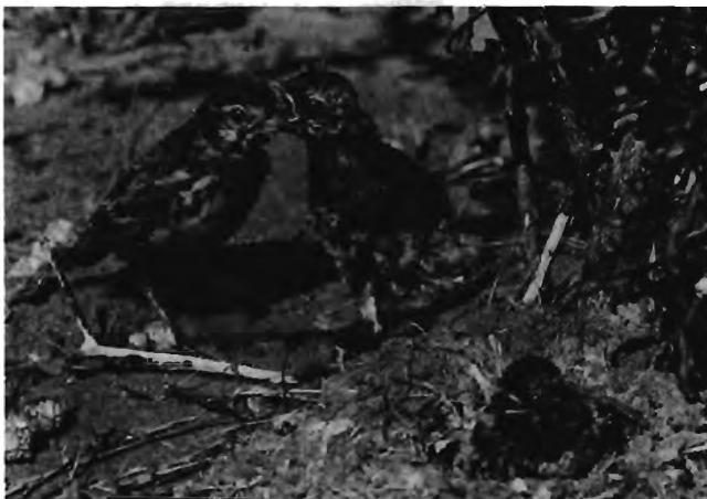
Fig. 15. Having successfully called one chick from the nest, the female Eremopterix australis returns to fetch the second chick.