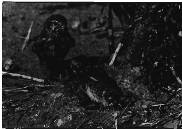
Fig. 14. A female Eremopterix australis calling her chicks out of the nest. The chicks are about 8 days old.