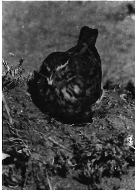
Fig. 2. A female Eremopterix australis brings nest material as she returns to incubate her two eggs.

Egg measurements appear in Table 1. The means for all species add little new to our knowledge of lark eggs in South Africa, except in the cases of Eremopterix australis and Alauda starki for which previous information was obtained from a single clutch (McLachlan & Liversidge, 1957).