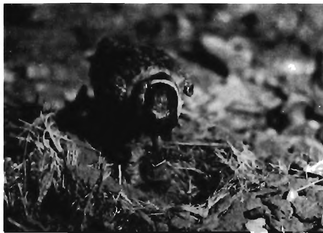
Fig. 10. A male Eremopterix verticalis feeds the abdomen of a large grasshopper to a small chick, which swallowed it after two attempts; if a chick of this size cannot swallow the food, the parent will eat it instead.