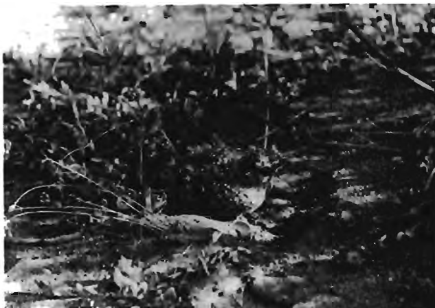
Fig. 19. An almost fully fledged Alauda starki chick, several days out of the nest, but able to fly only a metre or less at a time.