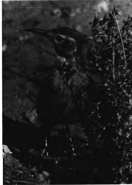
Fig. 12. Having just fed, a Chersomanes albofasciata waits for the chick to defaecate.

Nest sanitation is performed by both sexes. After feeding a chick, the parent will wait at the nest (fig. 12) until the chick deposits a faecal sac on the nest rim. The parent carries the sac in its bill to a distance of three or four metres and drops it on the ground; it then wipes its bill on any convenient stone.