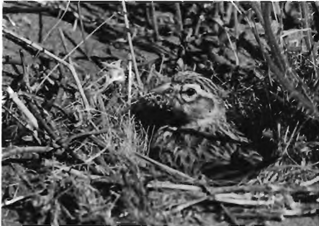
Fig. 5. Spizocorys conirostris incubating. Note the relatively large nest cup into which the whole bird fits.