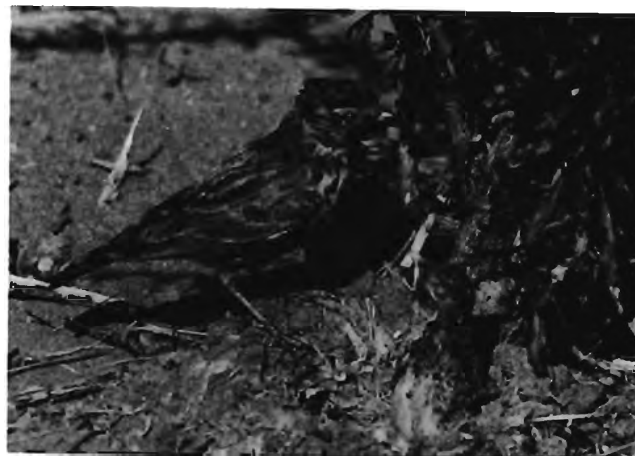
Fig. 16. The female Eremopterix australis calls the second chick which responds by begging. The first chick is hidden by the female.