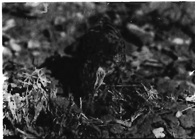
Fig. 8. A female Eremopterix verticalis feeding chicks.