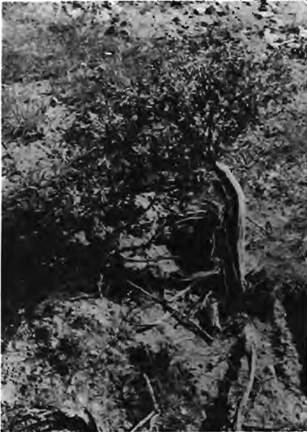
Fig. 1. The nest excavation of Eremopterix australis under a small shrub, with the first pieces of foundation material lying around the scrape.