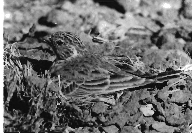
Fig. 6. A female Eremopterix verticalis brooding small chicks.