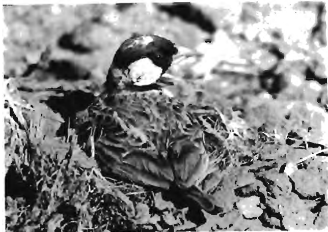
Fig. 7. A male Eremopterix verticalis brooding small chicks.