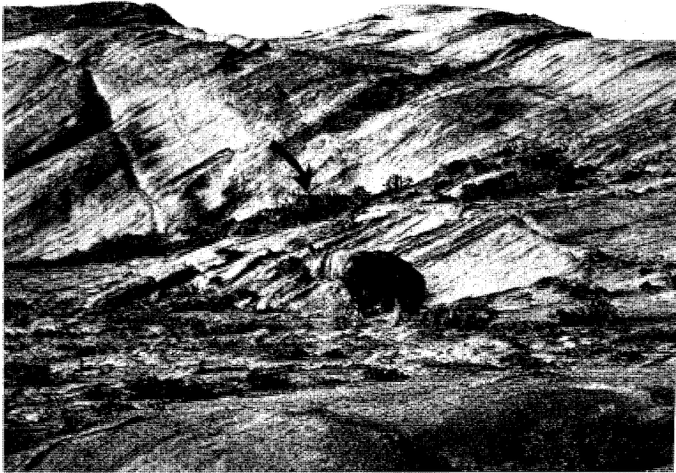
Figure 2. (b)

Figure 2. (a) The coastal den site. (b) The inland den site.