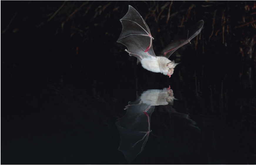
Fig. 8.2 A drinking event of the lesser horseshoe bat ( Rhinolophus hipposideros ) from a spring in the Dead Sea, Israel.

group of mammals (Mendelssohn and Yom-Tov 1999), with 12 species recorded in the Negev Desert (Korine and Pinshow 2004) and 17 species in the Dead Sea area (Yom-Tov 1993). Benda et al. (2008) recorded 14 species of insectivorous bats in Sinai, highlighting the diversity of these mammals in desert environments. The dryland regions of South America are the most species-rich habitats of the region and have the highest number of endemic species, even when compared to the tropical lowland Amazon forest (Mares 1992; Ojeda and Tabeni 2009; Sandoval and Barquez 2013). In the Yungas dry forest of Argentina, 55 % of the bat species may be endemics (Sandoval et al. 2010). However, this area is severely under-protected and very little research has been conducted on the bat fauna (Mares 1992; Sandoval and Barquez 2013) In Mongolia, more than half of the bat species only occur in arid and semi-arid regions (Nyambayar et al. 2010).