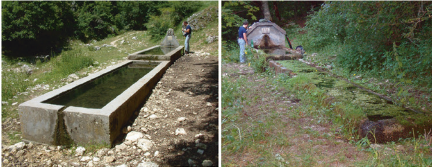
Fig. 8.3 Cattle troughs used by drinking bats in the Italian Apennines.

populations (Fig. 8.3). In Italian forests, bats also drink from the small ephemeral pools which form following heavy rain and only last few days or weeks (D. Russo, pers. obs.). Eavesdropping on other drinking bats is likely to play an important role in locating such sites and this behaviour is typical of species with manoeuvrable flight such as the barbastelle bat, Barbastella barbastellus , and the greater horseshoe bat Rhinolophus ferrumequinum .