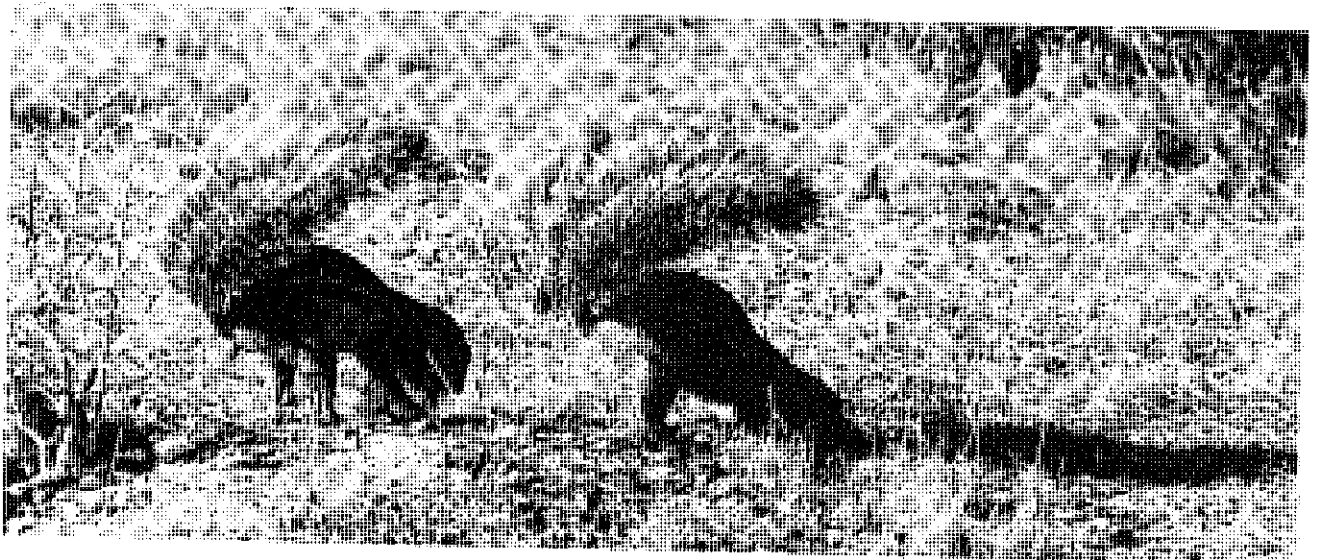
PLATE 1: Illustrating specialised thermoregulatory behaviour in Xerus inauris . The animals employ the flared tail for shading and orientate their bodies in the opposite direction from incoming insolation. Note the position of the shadows cast by the animals.