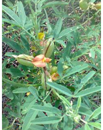
Crotalaria podocarpa with pods and few flowers