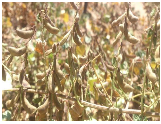
Rhynchosia holoserica with pods