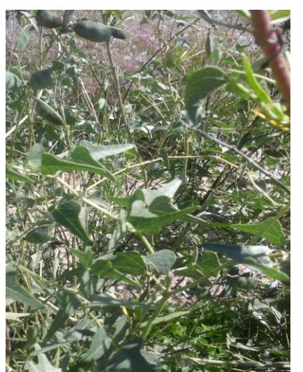
Wild Lablab (L. purpureus subsp. Uncinatus) with pods