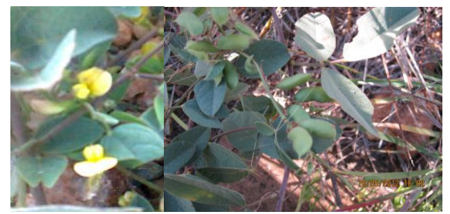
Rhynchosia totta at flowering and pod development stages