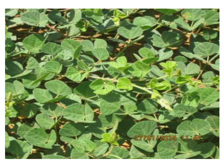
Young Rhynchosia totta var. totta