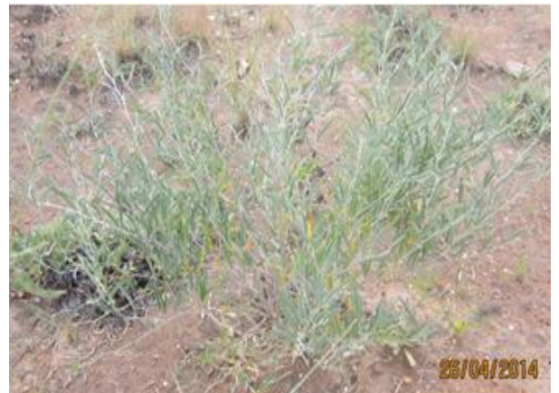
Ptychlobium biflora at early stage of growth