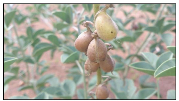
Crotalaria argyraea with pods