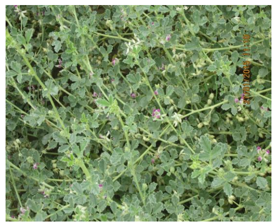
Cullen tomentosum at flowering stage