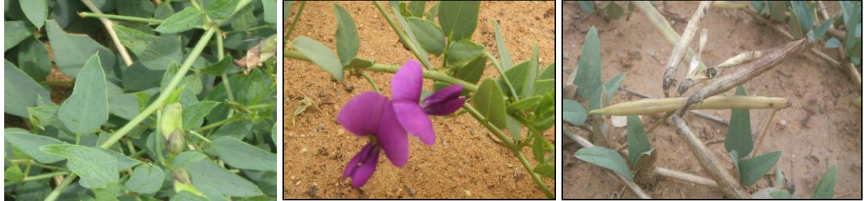
Otoptera burchellii at flowering stage