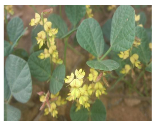
Rhynchosia holoserica at flowering stage