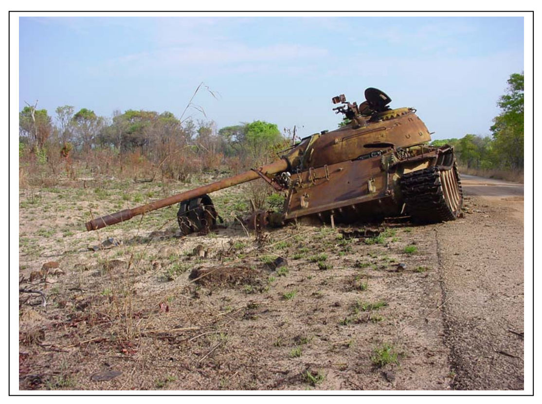
A Russian T54/55 battle tank lost in a minefield in the Okavango River Basin in Angola as evidence of the Cold War. The blood price paid for independence means that many African states jealously guard their sovereignty and resist supranationality.

This lack of popular support for supranational structures coincides with great importance placed on sovereignty by the newly formed states in the region. In many instances independence from colonial domination has been attained through a struggle for liberation, a memory indelibly etched on the world-view of those involved in governing such states. Sovereignty is seen as being important and is defended for fear of the consequences of giving it up. The popular resistance towards power being shifted away from the local level, in combination with the desire for sovereignty of the governing elites, precludes any meaningful absorption of individual states into a supranational structure. Thus what is required is not the replacement of the state by a larger supranational structure, but rather changes in the way actors within the state (at all levels from community to government) interact with their counterparts in neighbouring states.