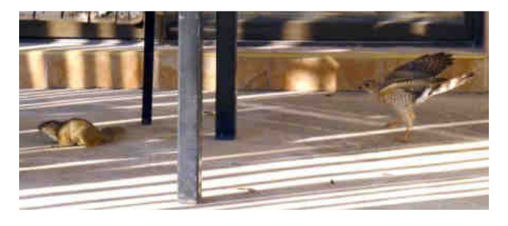
.. and then it was the squirrel that was faster.