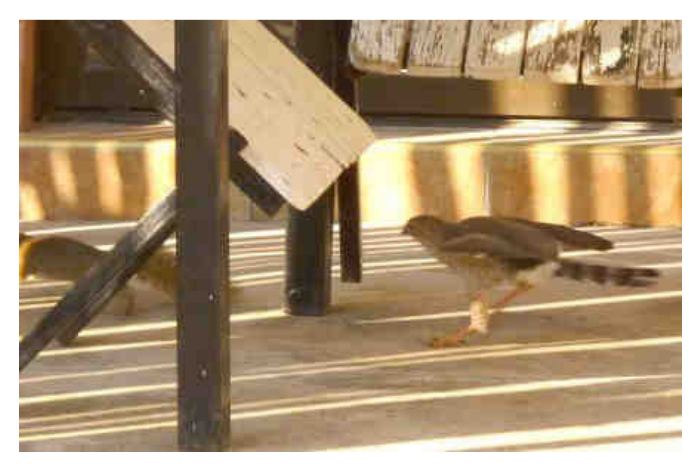
... one moment the Shikra gained ground ...