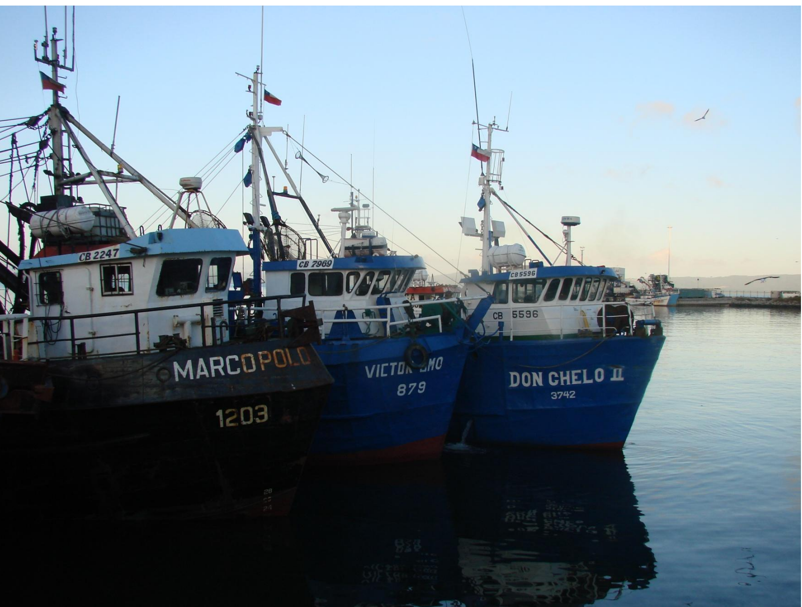
Photo: Purse seine vessels anchored in Chile

The diversity of fleets in Chile and the number of active vessels is one of the main challenges for our small team. The southern trawl fleet represents an important next step, where observer reports indicate high mortality rates.