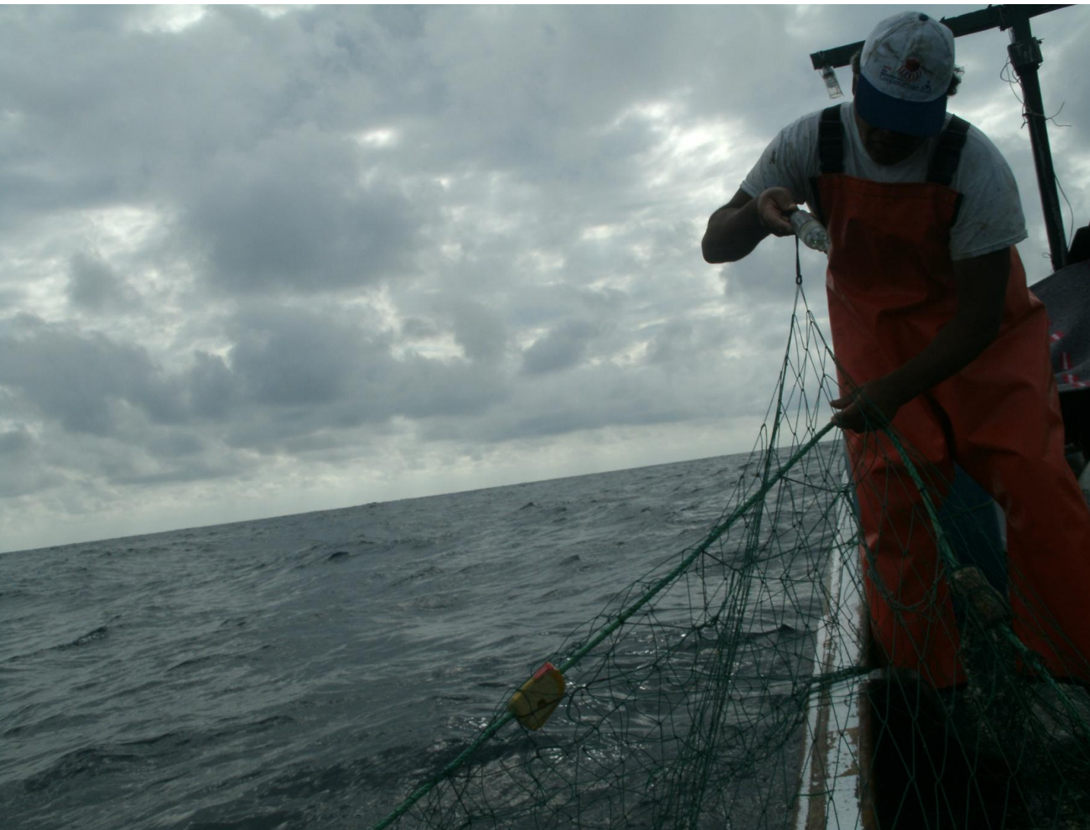
Drift net fishing in Peru

This represents exciting initial evidence that this measure may be effective at reducing multi-taxa bycatch in the fishery without affecting target species catch. Once we have a greater data collection to confirm these early results, our challenge will be to identify strategies to implement mitigation in small-scale fleets.