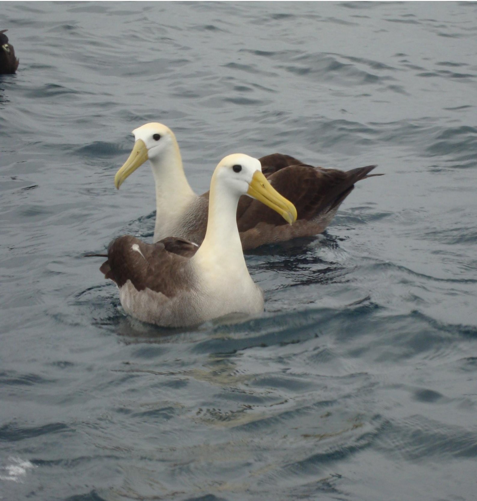
Photo: Waved albatross in Ecuador