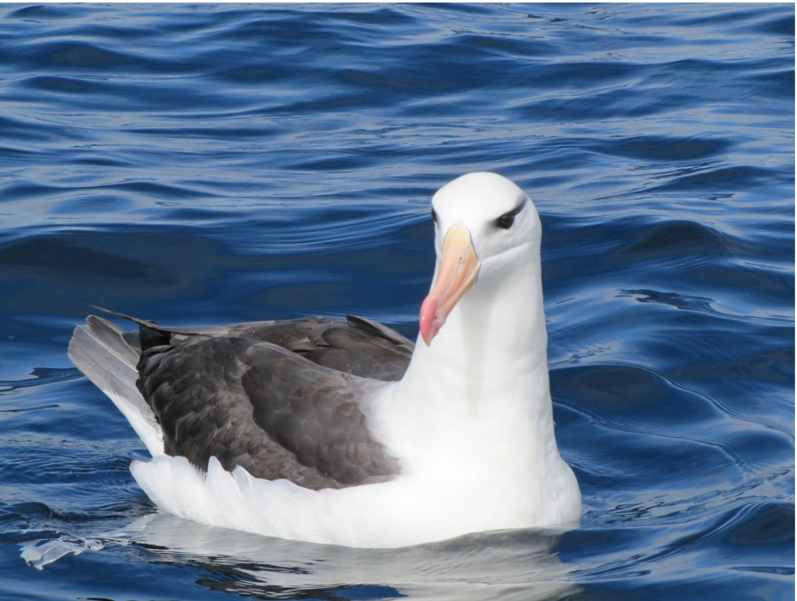
Black-browed albatross in South Africa

long-term sustainable bycatch reductions in the South African fleets. It has also begun a port-outreach project to reach distant water vessels which use Cape Town as a port.