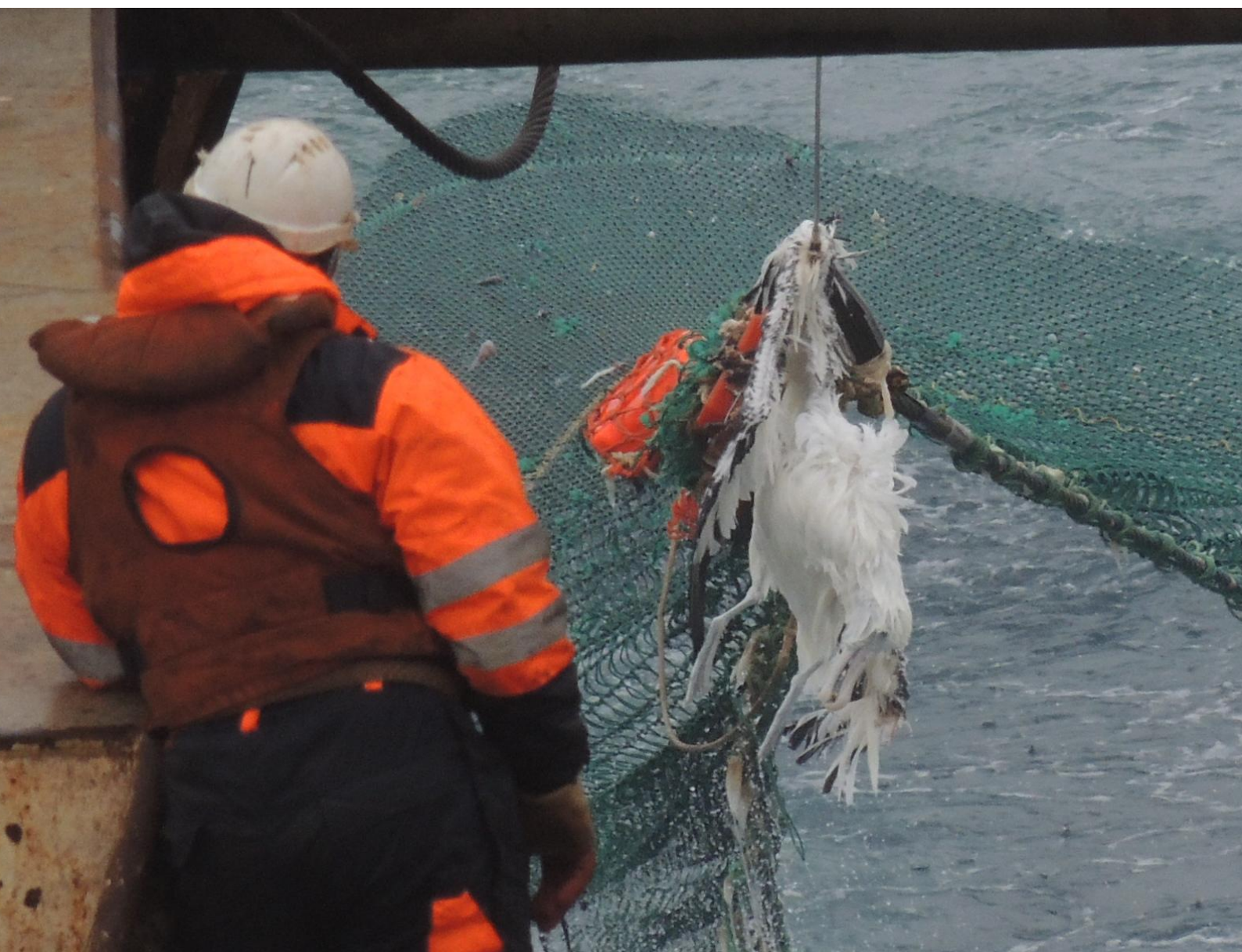
Photo: Southern royal albatross in the austral mid-water trawl fishery Nahuel Chavez

the last few months, we have our first observations from the mid-water fleet; initial results demonstrate a bycatch rate of 0.18 birds / trawl, with Northern Royal albatross Diomedea sanfordi from New Zealand among the species affected. Using all that we have learnt from our first fleet, and the government connections made, our aim is that, within 2 years, we will have both estimated the scale of bycatch in these remaining fisheries, and demonstrated solutions, with reductions achievable by 2020.