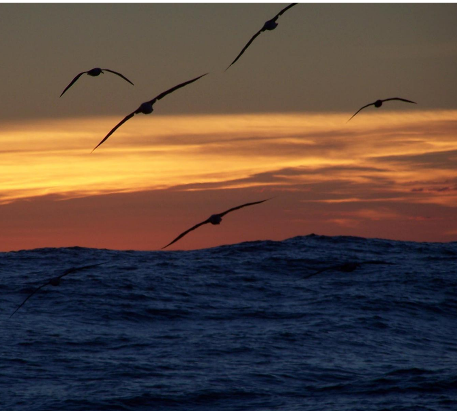
Photo: Sunset at sea in Uruguay