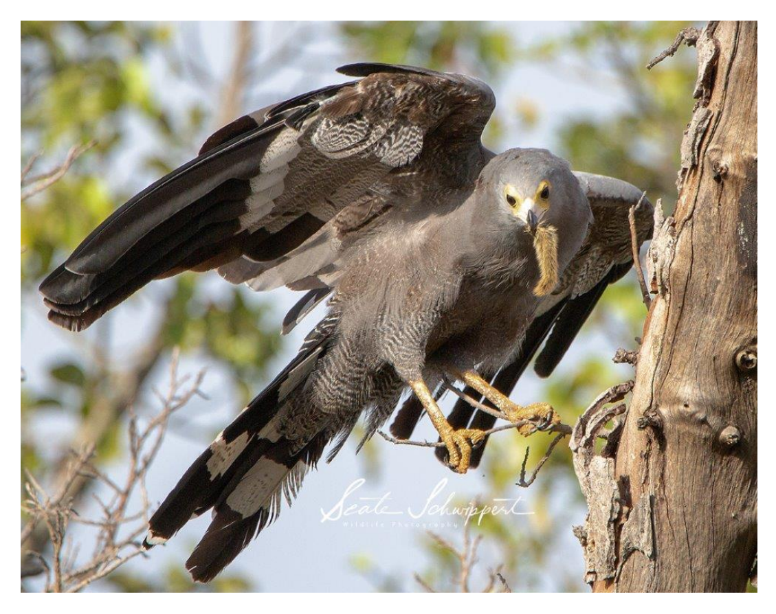
That's not really much of a meal......