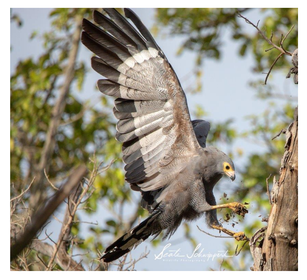
Only a fistful of debris this time