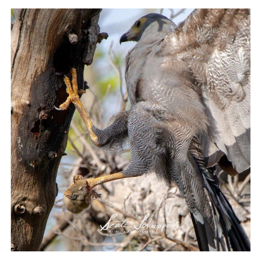
The squirrel is securely clamped