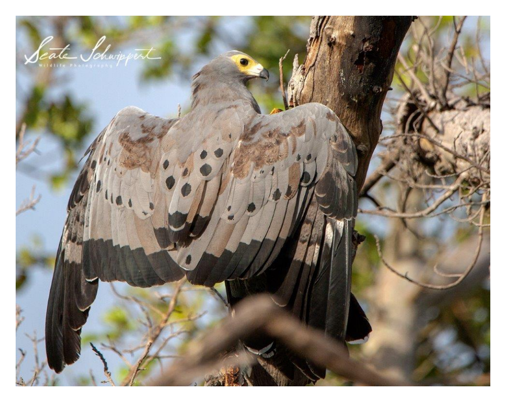
Feeling about inside the cavity