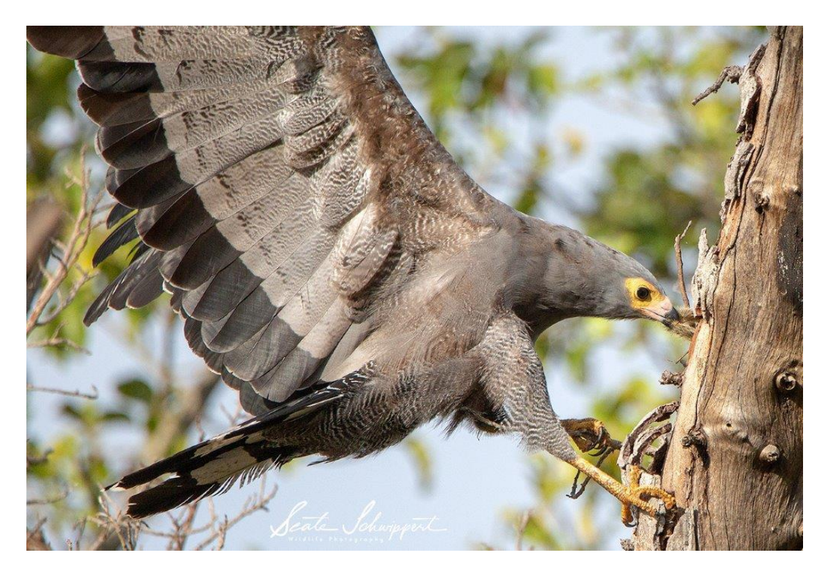
.....by the tail!