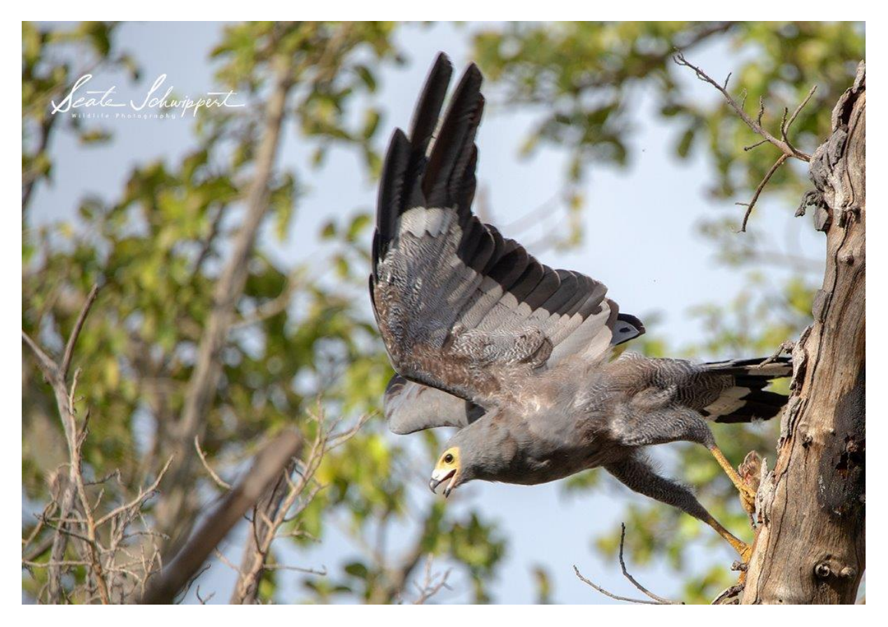
Score: African Harrier-Hawk 1 - Smith's Bush Squirrel 0