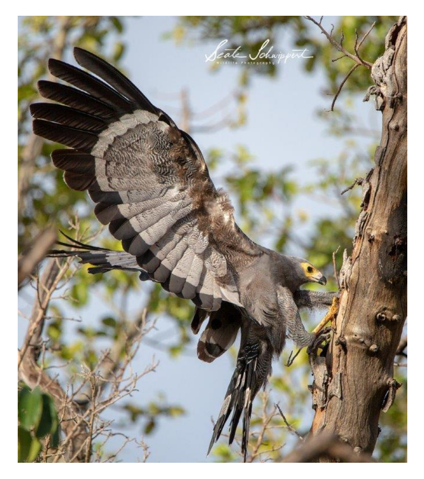
In goes that "double jointed" foot again