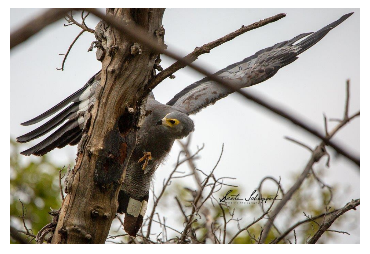
An African Harrier-Hawk finds cavities to investigate