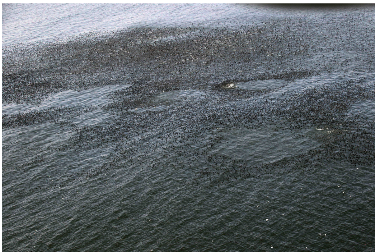
Figure 4: Flocks of Cape Cormorants, Great White Pelicans and Kelp Gulls at 16.51S, 11.82E recorded on 28 February (marked a in Figure 1) and at 16.72S, 11.81E on 27 February 2017 (marked b in Figure 1).

species. However, the Birdlife figure is double an estimated 117,000 breeding pairs for the species, but does not account for pre-breeding birds and those not participating in breeding. How many non-breeders should be added to Birdlife's estimate of breeding birds is difficult to gauge (J Kemper pers. com. 2017), and we have no idea of the proportion of pre-breeding individuals amongst those photographed in March 2017 on Tigres. Crawford et al. (1991) had earlier estimated the total population of Cape Cormorants to be 1.355 million.