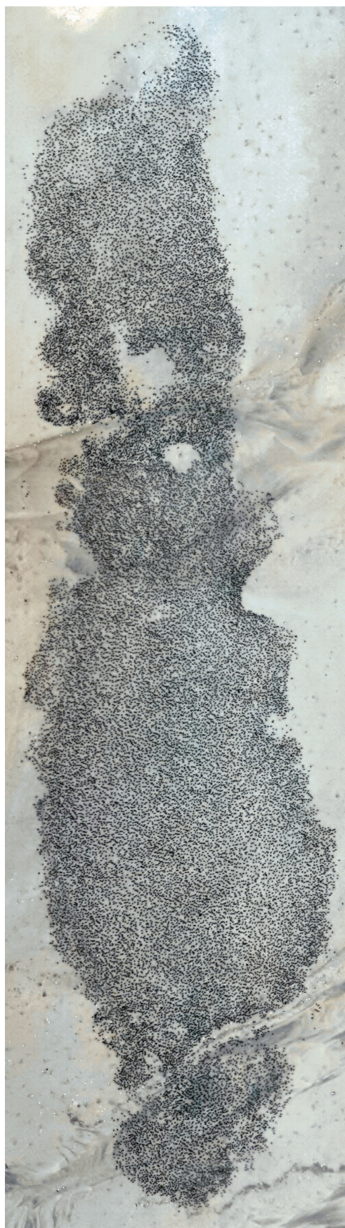
Figure 3: An estimated 28,058 individual Cape Cormorants roosting in this, the largest single flock photographed on Tigres in March 2017.

Cape Cormorants were found nesting in 349 colonies, each having an average of 46 nests. The nests were evenly spaced across the colony areas (see examples in Figure 2) and assumed to be active because one bird was sitting on each nest. The birds visible could have been adults or well-grown nestlings if the cormorants on Tigres breed at times similar to those in Namibia (October to February – Kemper & Simmons 2015).