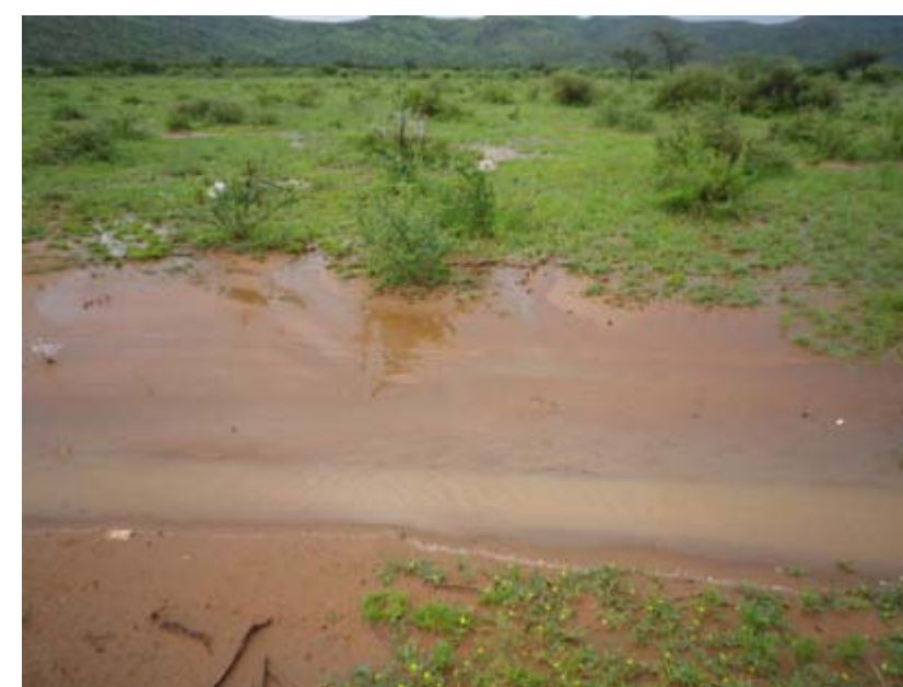
Figure 9. This is an example of how poorly located and constructed access tracks can drain landscapes as effectively as any true donga. In this case a creek from the mountains in the background has flooded out in a fan when it has hit flat ground, depositing rich alluvium in a highly productive system. The track is cut into the land and has started micro-terraces (broad, small water fall heads) cutting back into the floodout fan. The track starves areas of the fan below it.