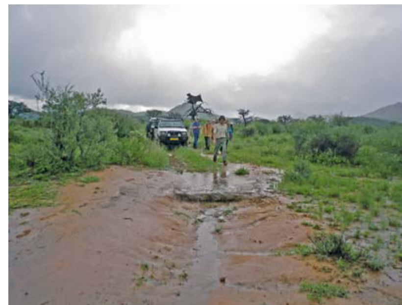
Figure 13. A head is cutting back up the track towards the area of the previous photographs. This head is creating a new, deeper base level below the natural landscape and thus helping the existing track "sucking" the landscape above dry and when it gets back to the area above, it will probably set off a new series of micro-terrace faces to accelerate the drying of this fan and virtually cut off flow to the area of the fan downslope.