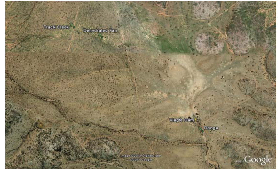
Figure 2. In this example on Farm Krumhuk, a creek flowing out of the mountains (outside and to the left of the Google image) floods out when it meets flat terrain and then splits its sheet flow because of subtle slopes in the plain below. Some goes north-east to a dam near the homestead and some flows down to the vlagte (seasonally inundated wetland) blocked by Vlagte Dam. We know the floodout fan splits because of the distinct donga heads eating back towards the creek's floodout point from different directions. The "track thief" may well have pulled water towards it and an animal path would have been enough to start the donga head upslope (left). Wherever you see sections of track broader than others on Google Earth (which is free), it is likely they are cut down and cutting back laterally (sideways) to drain landscapes. Should either of the donga heads in the case study of the track creek (Figures 9 to 13) reach the floodout point, there will be a downpipe from the mountains to the nearest major channel and that creek's contribution to soil moisture balance of the plain will be totally lost (as has already happened with other creeks).