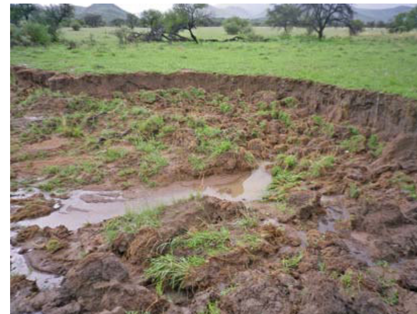
Figure 7. Once the storms were over, it was clear that the donga head had eaten its way back into the healthy ground and well up to five metres in places. Well after the rain stopped, the waterfalls continued sucking the plain dry, with the central, lowest waterfall stopping last, leaving no more surface water upslope.