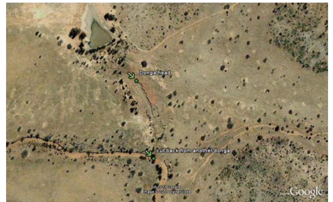
Figure 3. The donga head cutting back towards the Vlagte Dam on Farm Krumhuk has cut back from a more deeply cut down channel that turns sharply west. This deeper channel also ends upslope in gully heads indicating that it is not a natural drainage feature either. The concentrated overflow from Vlagte Dam has spilled over into the incised channel and set off the current donga head cutting back to the dam's spillway. The old, unchanneled water course is parallel to the donga, as indicated by the line of trees.