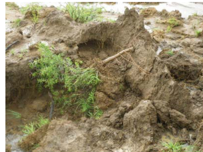
Figure 8. Young Acacia karoo plants establish above the rim of the donga head where they are no longer drowned at seedling size. Unlike their counterparts in the most recently formed part of the donga below them, these bushes are doomed, as the donga head will, in the next big storm, erode the soil that now supports them. A larger plant can be seen in the foreground. This plant dates back to an earlier season than the two smaller ones in the background. It may survive until the next major head retreat. Then the two smaller ones will in turn be "hanging on the edge".