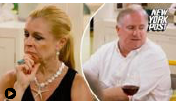
'Blind Side' Tuohy family under fire over resurfaced 'Below Deck' appearance discussing the film: 'Red flag'