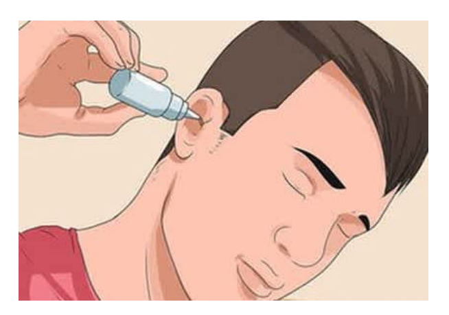
Ringing Ears? when Tinnitus Won't Stop, Do This (Watch)