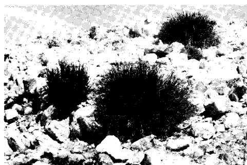
Rössing Mountains, Rosenquarzkuppe 21. 9. 1976. In association with Kleinia longiflora and Sarcostemma viminalae