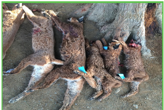
Photo 2. Caracal ( Caracal caracal ) control on farmlands in the central Karoo (Marine Drouilly)

In their struggle to combat stock losses, some farmers hunt Caracal themselves, make use of DCA or “specialist” hunters to remove Caracal (and Black-backed Jackal) from their properties (Photo 2), or they send some of their