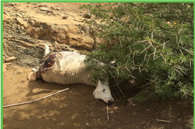
Photo 1. Ewe killed by a female Caracal ( Caracal caracal ) on a farm in the central Karoo (Marine Drouilly)

species may actively limit each other's numbers in certain areas; their diets do not only overlap to a large extent, but they have been reported preying on each other's young (Ferreira 1988; Pohl 2015), and adult Caracal even kill and eat adult Black-backed Jackal (Melville 2004; Q. Martins unpubl. data).