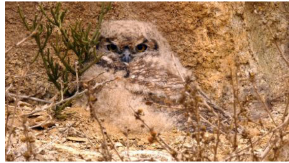
© Eckart Demasius – 24 November 2012

I climbed up the rock face for a better view and with the aid of some excellent Leica optics and a decent zoom some close-up shots were taken.