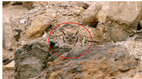
© Eckart Demasius – 24 November 2012

During all this time we were watched by one of the parents, equally well blended into the the surroundings.