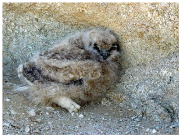
© Christa Britz/Riana Swart - 14 November 2012

At the same time however I was as frustrated as could be as I was so tied up with work commitments that it was impossible to even think of asking them to take me to see the owl chick.