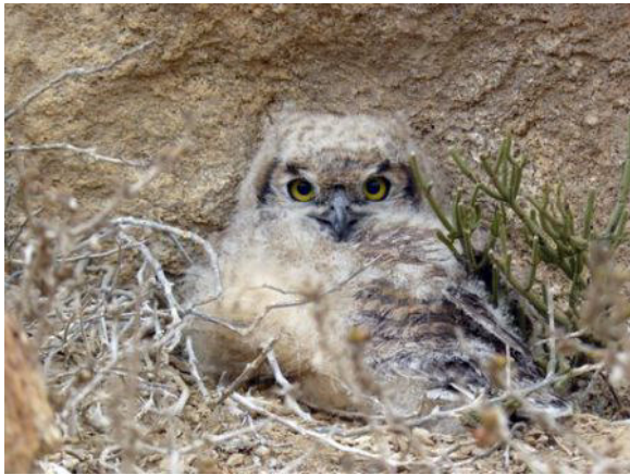
21 November 2012