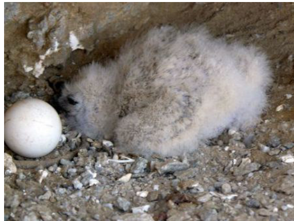
© Christa Britz/Riana Swart - 30 October 2012

One of my birding friend ladies made my hectic working day by sending me a number of photographs of a newly hatched Spotted Eagle-Owl.