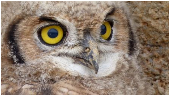
© Eckart Demasius - 1 December 2012

The Leica optics did their trick again and more close-up shots were taken.