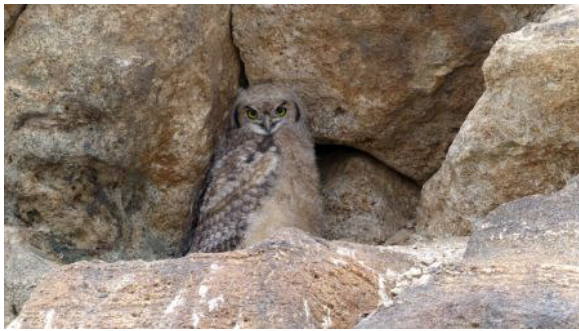
© Eckart Demasius - 1 December 2012

Once again the chick had moved its location but as nothing escapes Riana's eagle eyes we soon found it sitting on a rock ledge along the river bank.