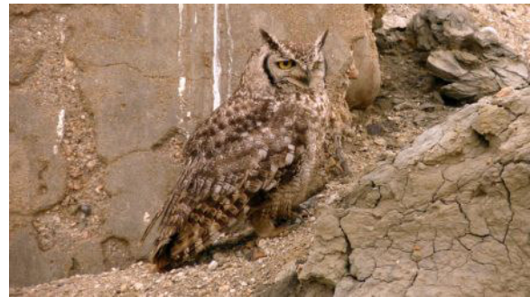
© Eckart Demasius – 24 November 2012

Soon it flew off; we also went on and I still managed to get a nice close view of the adult bird.