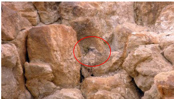
24 November 2012

Soon Riana’s eagle eyes found the chick – what amazing eyesight this lady has. The chick blended in so well with the rocks in the background that I would not have seen the little owl.