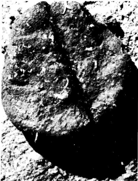
Tuber of Ceropogia sp. large, hard, dark brown ca. 60 mm in diameter.