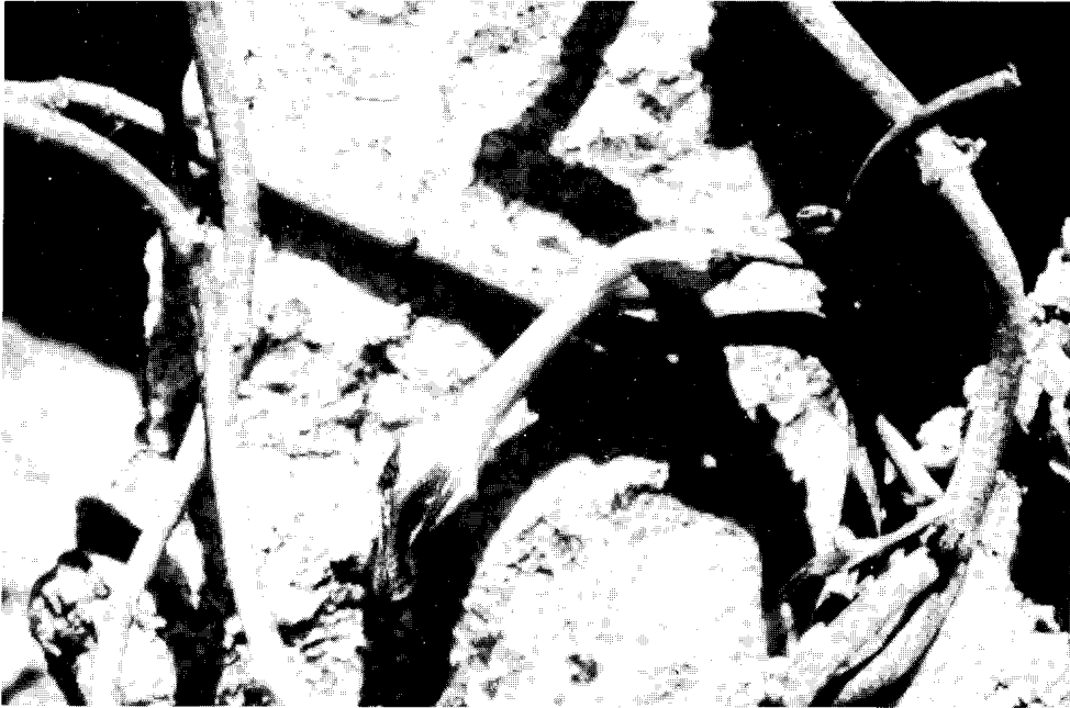
Ceropogia sp. found in rock crevice (Lavranos & Pehlemann 20134)