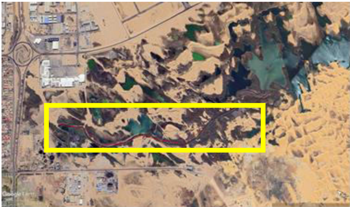
The proposed 2.2-kilometre-long purified effluent pipeline route (in red)