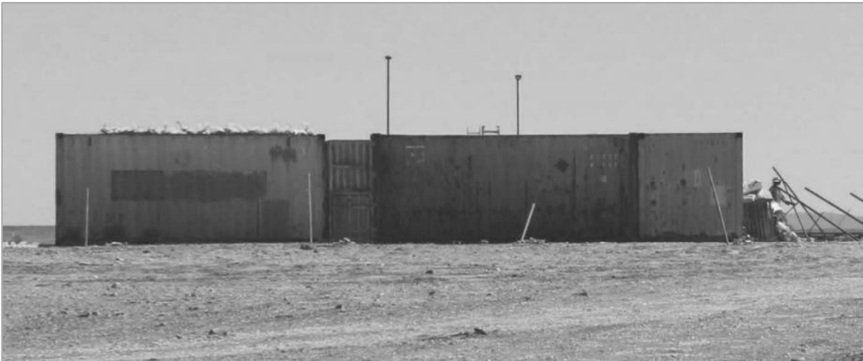
Figure 11: Shows current status of the Base-camp facility consisting of old shipping containers left by previous license holder

Given the location of the EPL and that it is situated in a national park, a base-camp consisting of shipping containers (already on-site see Figure 11 , left by previous mining site owners) to house the equipment and for employees to guard the facility will be established and will be enclosed in 100m x 100m fence facility. Otherwise, it is strictly recommended that other staff members are accommodated at the closest lodging facility at Cape Cross and or Henties Bay (whichever is practically suitable) and commute daily to and from the project site.