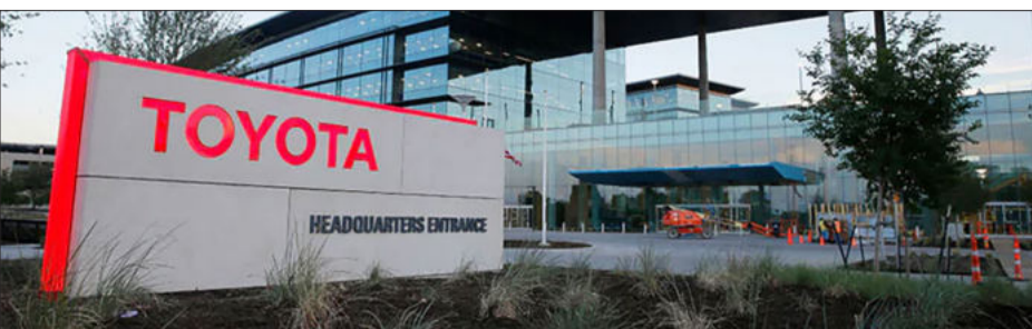
The world's top-selling automaker said it now expects to sell half a million fewer vehicles than planned. Photo: Contributed

Toyota said higher material costs pushed down its profits in North America in the first half, while business in Europe was affected by its decision to pull out of Russia. The company announced in September its decision to end production in Russia, citing supply chain problems. - Nampa/AFP