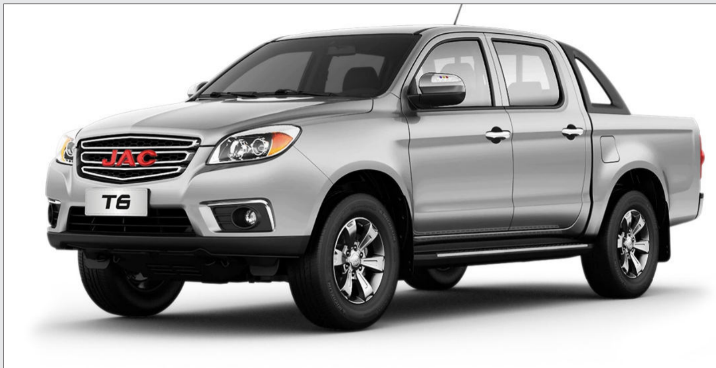
The T6 is JAC Motors' seventh-generation international pick-up design.

"We are happy that the proven T6 2.8L TDI, which was available in the country