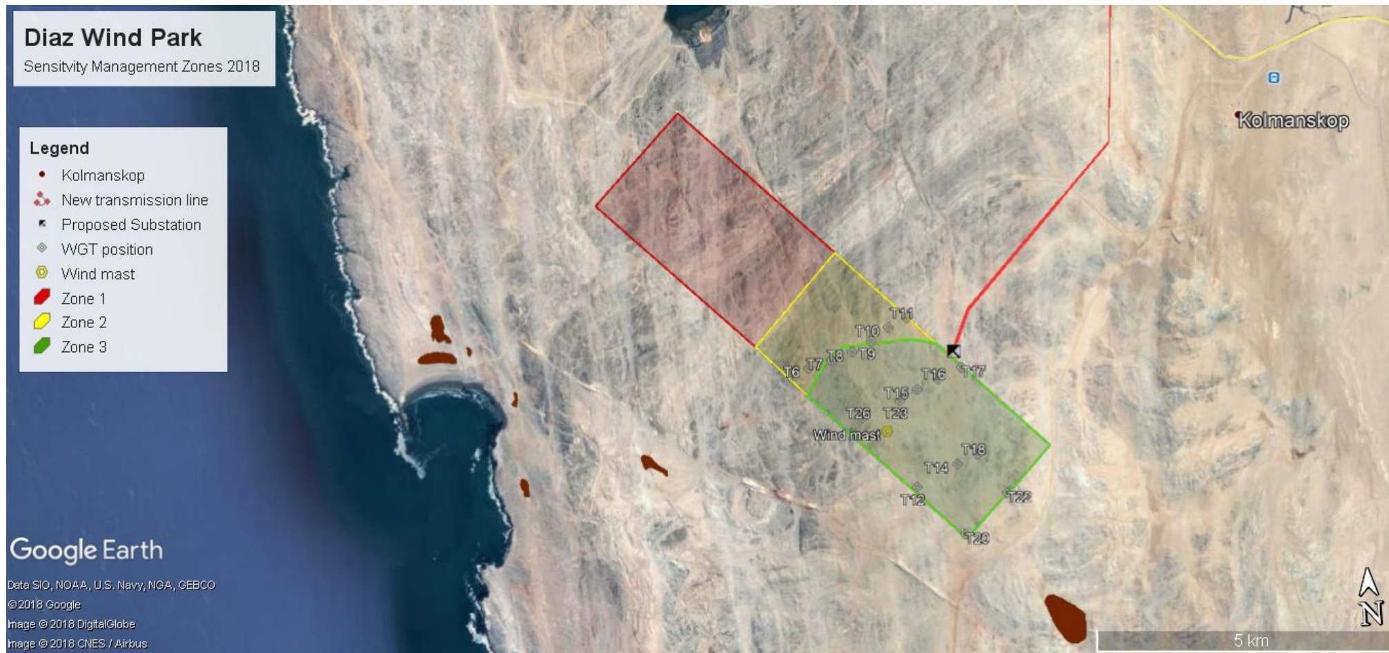
Figure 2: Environmental Management Zones of the Site