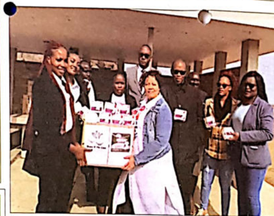
HANDOVER ... Namibia Wildlife Resorts together with final-year Unam law students donated sanitary pads in the Hardap region last week Friday.