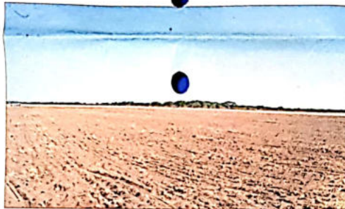
Potential... The vast land of Ondera farm.