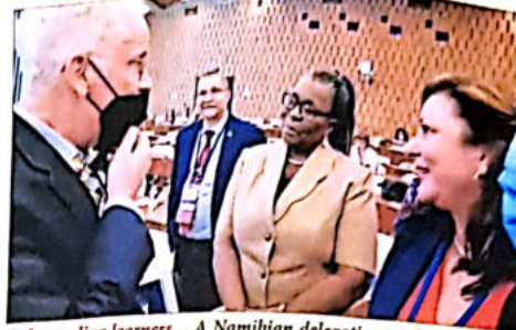
Safeguarding learners... A Namibian delegation at the pre-summit in Paris.

to attain their educational achievements, it is essential that they fully participate in educational activities that are provided in a receptive and safe learning environment.