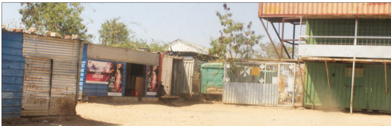
Murdered... The body of a 22-year-old man was found in a refrigerator at Herero Mall.