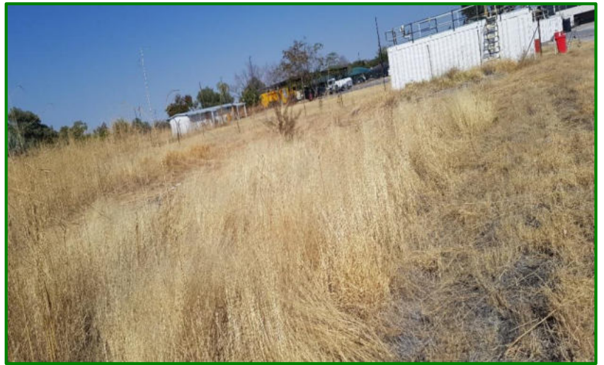
Figure 2: Pictures of the proposed development site at ATYT Airport, Ondangwa

Below is the proposed layout design of the site and the bulk Fuel Storage Facility (Container) to be used by the proponent.