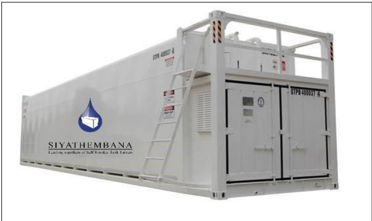
Figure 4: Layout Design of the Jet A-1 Fuel Container Tank