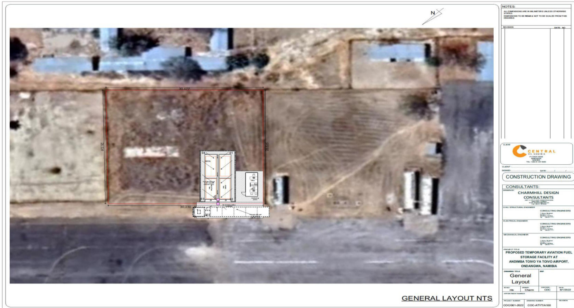
Figure 3: Layout design of the proposed Fuel Storage Facility