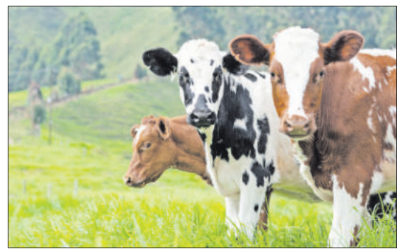
New Zealand is planning a “world first” levy on emissions of methane and nitrous oxide, produced by the nation’s six million cows and 26 million sheep as a step towards tackling climate change.