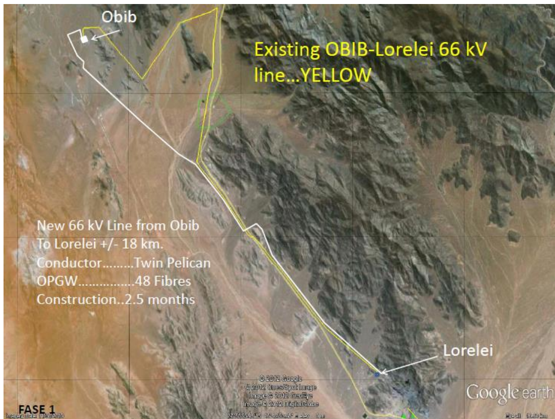
Alignment of proposed new 66 kV power line from Obib to Lorelei substation.