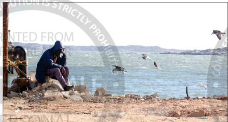
Safeguard... The Atlantic Ocean on the Namibian coast.

According to Kuugongelwa-Amadhila, the conference affords coastal towns the opportunity to leverage the value of partnerships and interconnectedness