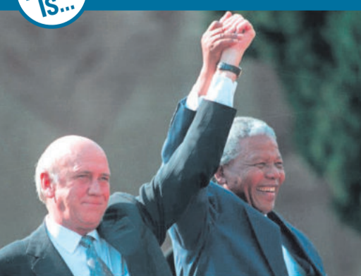
They say that all good things come to an end, thankfully this remains true for horrid atrocities as well. One such ending took place in 1991 with the ending of apartheid, a system of racial segregation that existed in South Africa on the back of legislation introduced by the National Party. The Day of Reconciliation was introduced in 1994 as a way to heal the rift between the people of South Africa, and bring harmony to a nation still suffering from decades of injustice.