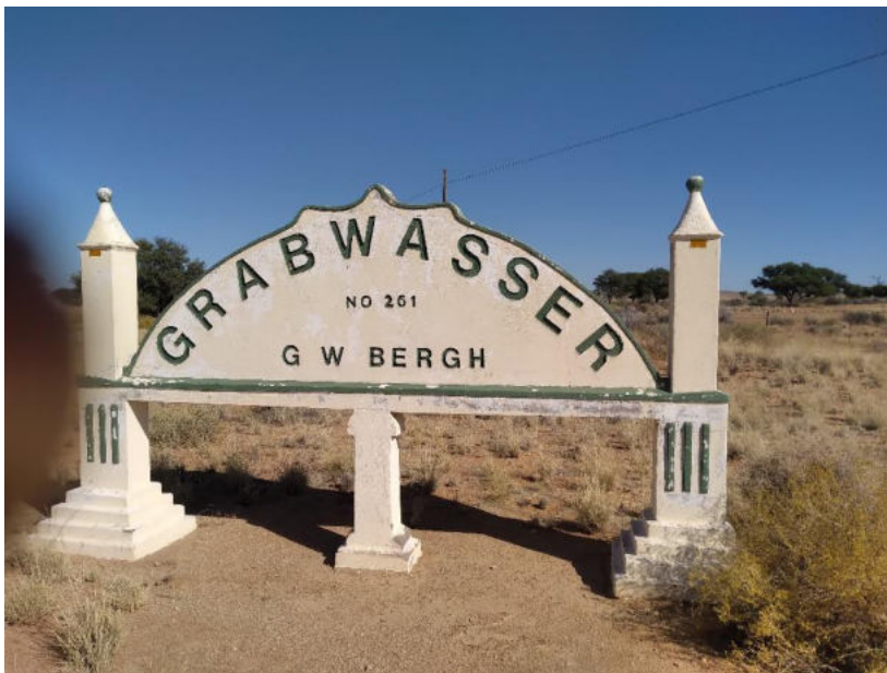
Fig 1 , Showing entrance to one of the farms in the EPL 8724 area.

Masioline Zeenaro Kasiringua, (the Proponent) holds mineral rights under the Exclusive Prospecting License (EPL) No. 8724 for Base, Rare Earth Elements and Industrial Minerals. The EPL 8724 was partially granted on the 28/3/2022. The EPL was partially granted pending ECC on 28 th March 2023. The EPL No. 8724 is located in the Karasburg District of the Karas Region, in the southern Namibia. The EPL is located to the southwest of the settlement of Grunau. The EPL 8724 area totaling 13064.6555 Ha cover parts of the following private farmlands: Nakais-11, Grabwasser-261, 408 Gamkab and Grunau N.W