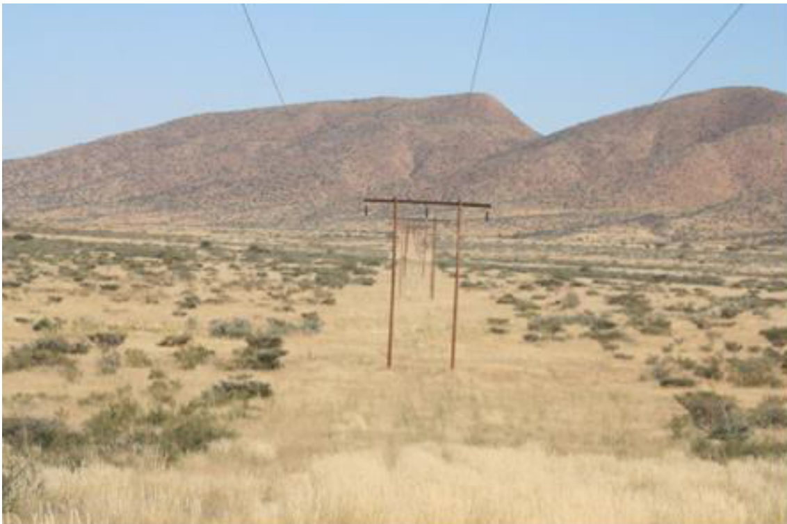
Figure 2. The hills to the west of the Kransberg Station area.

The general Khan – Marble 66kV transmission line route, have certain anthropomorphic influences mainly associated with roads and tracks, railway line, transmission line and associated access route and infrastructures and farm infrastructures. The impact of common line activities mainly inspections and general maintenance would be site specific and have a relatively small environmental “footprint” and is not expected to have a major impact on the environment.