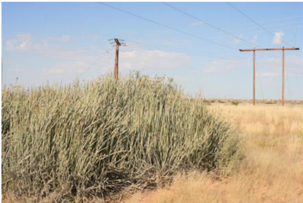
Figure 9. Euphorbia damarana (Damara Euphorbia) – endemic, C2 – in the vicinity of the Khan Substation