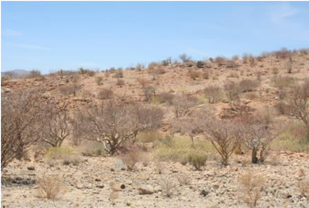
Figure 8. Various Commiphora spp. associated with the rocky area between the Kransberg Station and Usakos area.

The most important species in the area are viewed as Commiphora dinteri , Commiphora saxicola , Commiphora virgata , Cyphostemma bainesii , Cyphostemma currorii and Erythrina decora (see Figures 8-10).