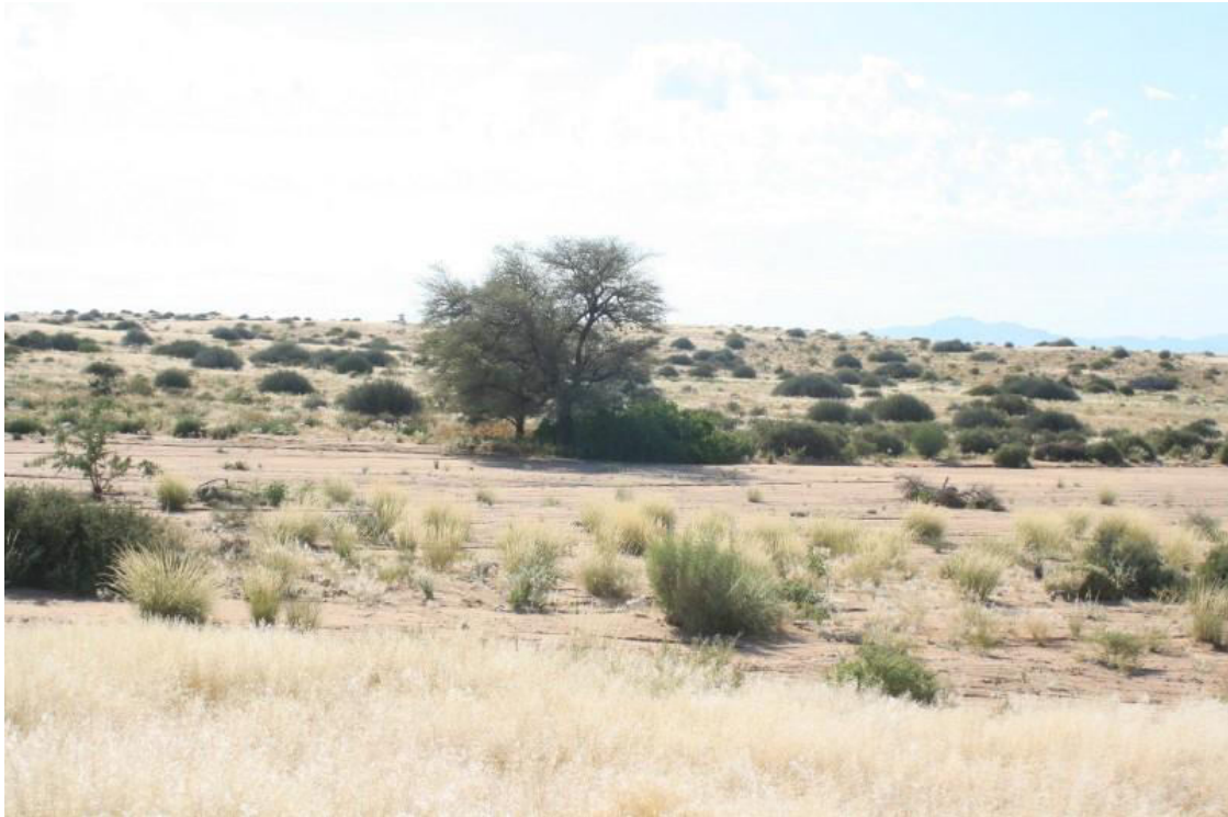
Figure 5. Ephemeral drainage lines are viewed as “high” sensitivity – i.e. potentially high biodiversity and thus important habitat.

In terms of environmentalist sensitivity, 10.4% of the route is viewed as “high” sensitivity, 0.3% of the route is viewed as “medium” sensitivity – i.e. unique habitats – and 89.3% of the route viewed as “low” sensitivity. The sensitive areas are identified as ephemeral drainage lines and rocky/mountainous area. The rocky/mountainous areas (e.g. with unique Commiphora spp.) and the ephemeral drainage lines (e.g. Khan River) are viewed as potentially important habitats and these areas should be treated with care.