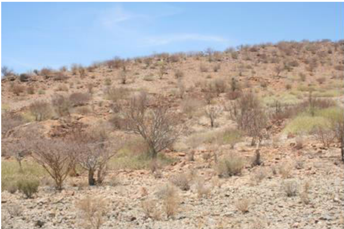
Figure 7. The rocky/mountainous areas with high densities and variety of Commiphora spp. is viewed as “high” sensitivity i.e. potentially high biodiversity and thus important habitat