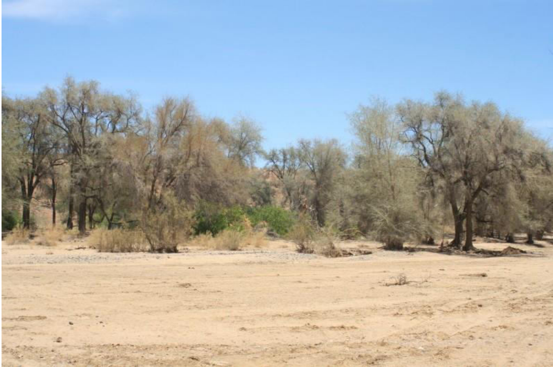
Figure 6. The Khan River area with large protected tree species (e.g. Faidherbia albida) is viewed as “high” sensitivity – i.e. potentially high biodiversity and thus important habitat.