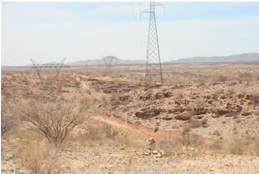
Figure 4. The rocky area between the Kransberg Station and Usakos

The route passes through 6 “hotspot” area with 5 sections viewed as “high” sensitivity (i.e. potentially high biodiversity), 1 section as “medium” sensitivity with the rest of the route viewed as “low” sensitivity (See Annexure 1; See Figure 5-7).