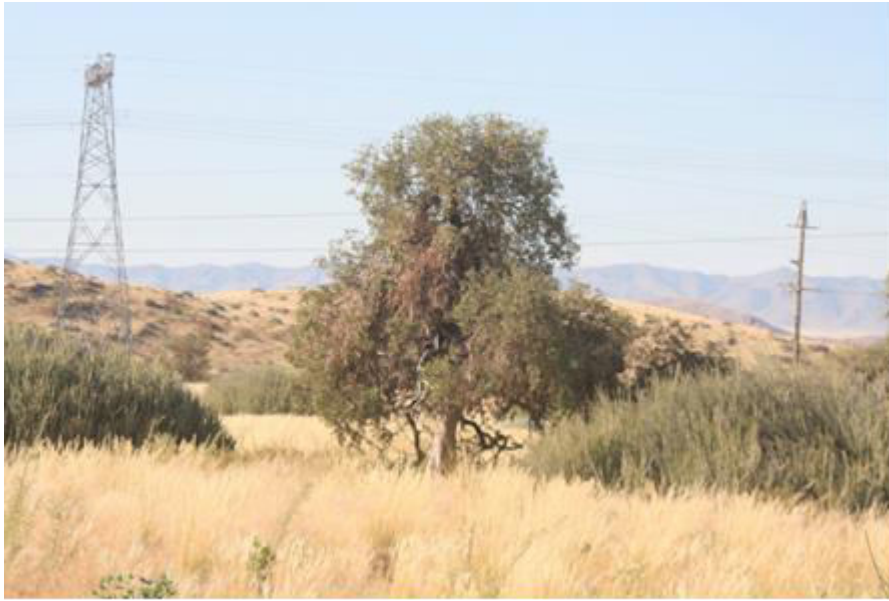
Figure 10. Maerua schinzii (Ringwood tree) – Protected F, LC – individuals scattered throughout the general area.