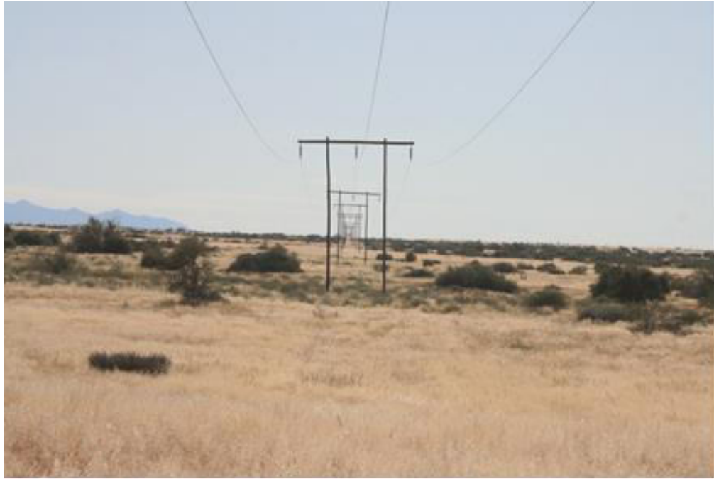
Figure 3. The area between the tarmac road (Swakopmund-Usakos) and the Khan Substation area.