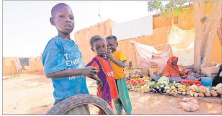
Children wait to buy vegetables in a residential area in Khartoum North, Sudan.