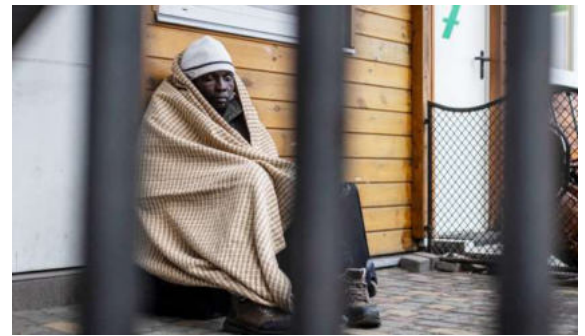
An African man rests as refugees from many countries - Africa, the Middle East and India - mostly students of Ukrainian universities are at the Medyka pedestrian border crossing fleeing the conflict in Ukraine, in eastern Poland