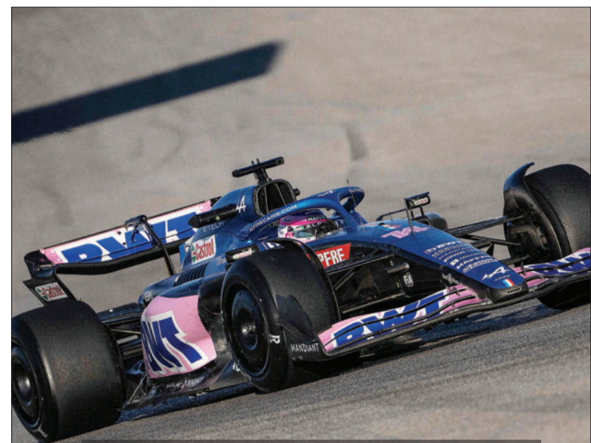
Complaints... Fernando Alonso says the result of Alpine's appeal will dictate whether Formula 1 is going in the right direction for the future.