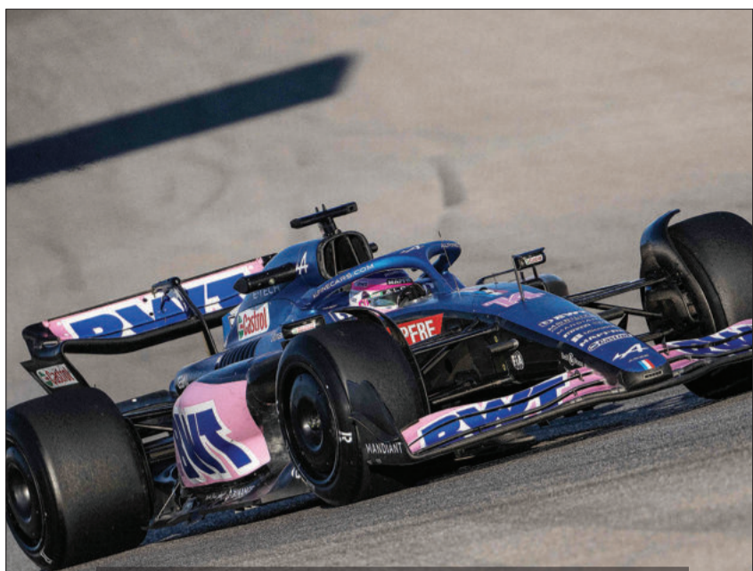
Complaints... Fernando Alonso says the result of Alpine's appeal will dictate whether Formula 1 is going in the right direction for the future.