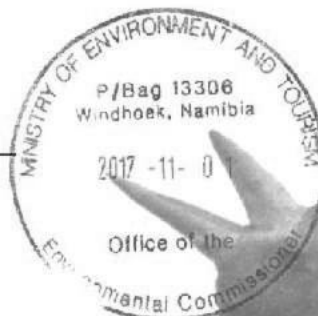
Teofilus Nghitila ENVIRONMENTAL COMMISSIONER