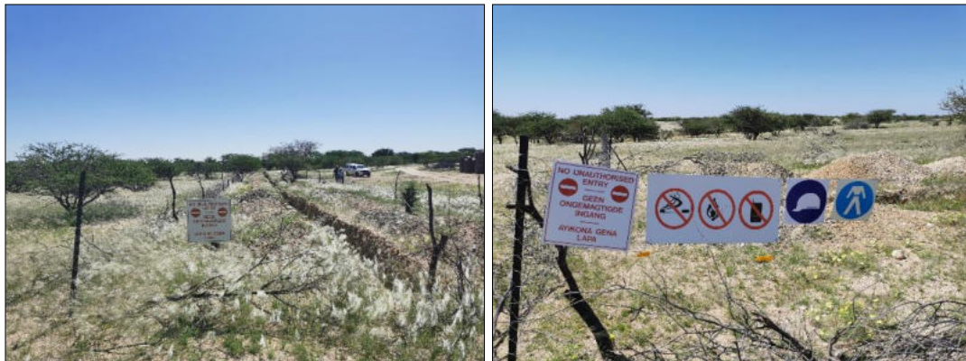
Figure 2-1: A fenced off exploration trenches awaiting backfilling upon completion of exploration works on an active EPL near Okombahe in 2022