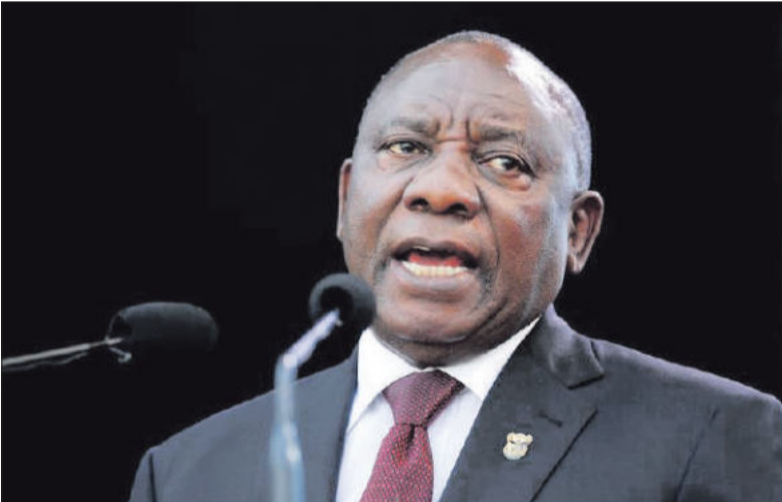
South African President Cyril Ramaphosa.

"There recently has been more progress on the government's reform agenda pushed by a focus on process bottlenecks under Operation Vulindlela, but full implementation