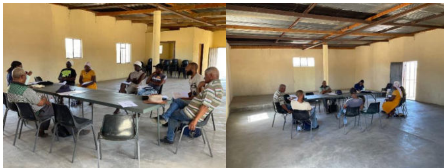
Figure 1: The consultation meeting in progress at the Community Hall in Tubusis (23 March 2023)