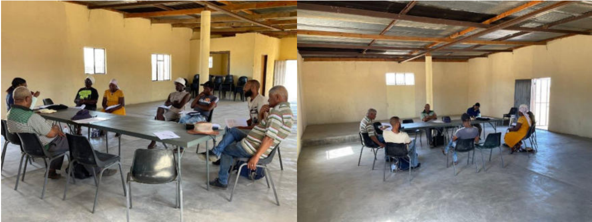
Consultation meeting with the Gaingu Conservancy management in Tubusis on 23 March 2023