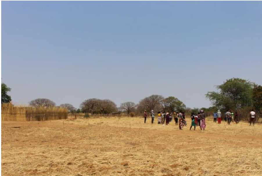
Figure 8: Existing land use-Crop field.