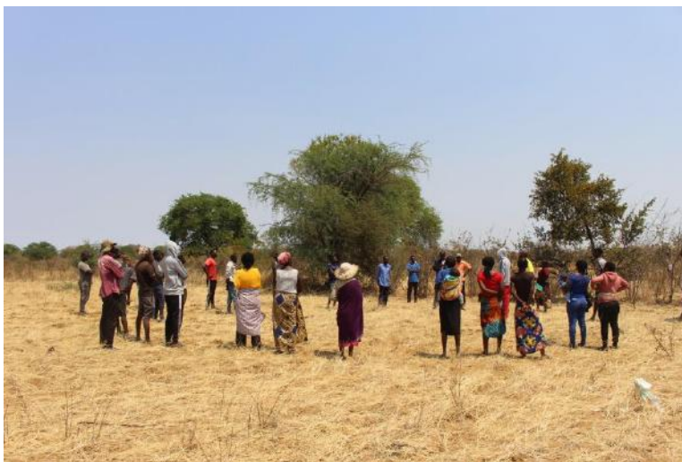
Figure 7: project site

However, most of these species are not present on the specific site as the surrounding area has been cleared or degraded due to crop farming. But the removal of any vegetation in the surrounding area should still be done in a properly managed, planned and responsible manner to avoid the destruction of unnecessary ground cover or protected species. The rehabilitation of disturbed areas is important and should be done in accordance with the Environmental Management Plan (EMP) hence the project will have minimal impacts on the environment