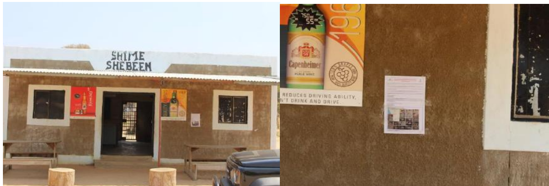
Figure 10: Site notice-Entertainment Establishment