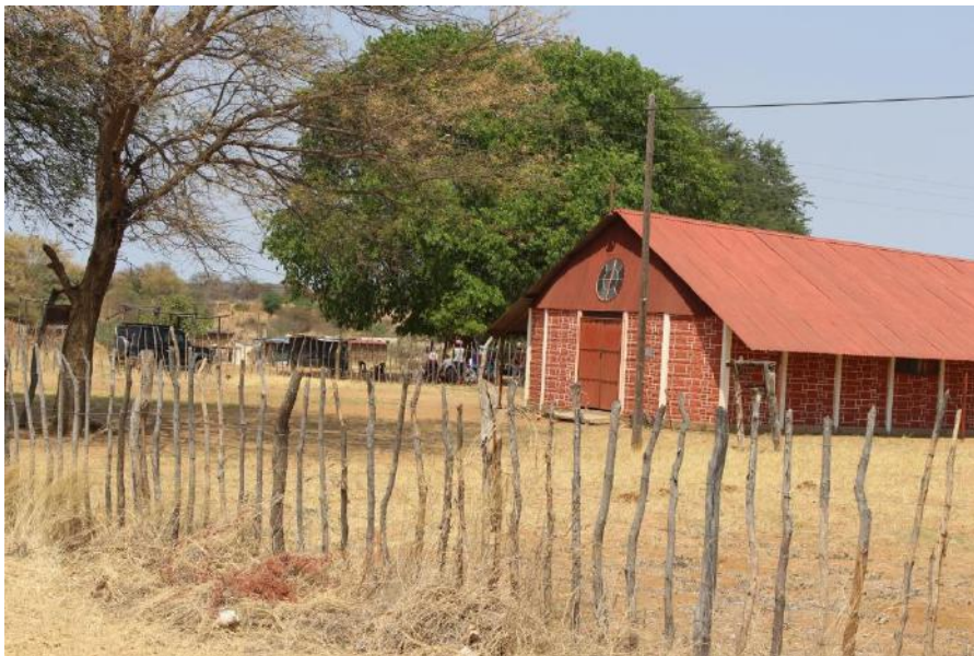
Figure 4: Church