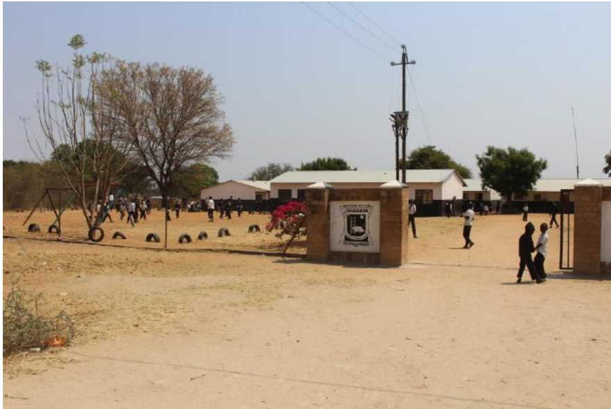
Figure 3: Dr Joseph Diescho Senior Primary school