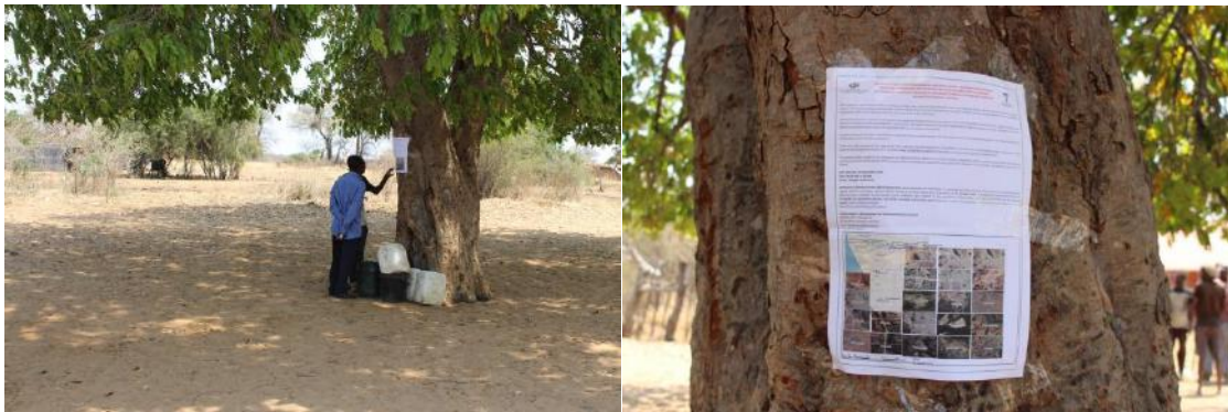
Figure 9: Site Notice

A site notice was placed at the communitybased waterpoint, and Entertainment Establishment. These provided information about the project and related EA while providing contact details of the project team.