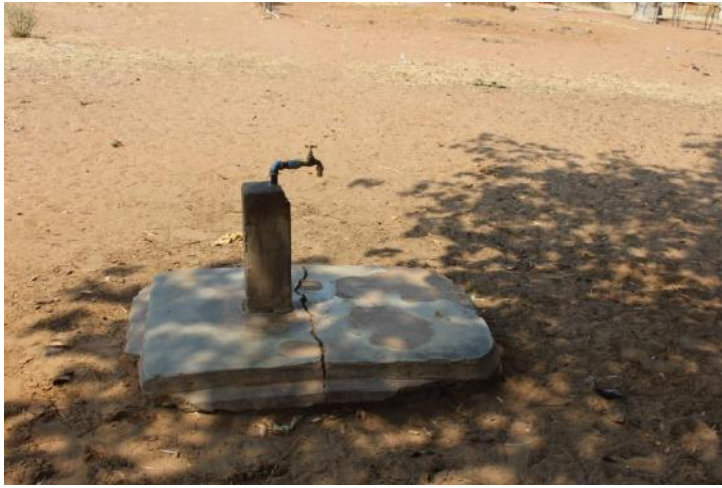
Figure 6: communitybased waterpoint