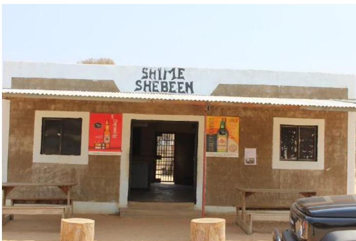
Figure 5: Entertainment establishment