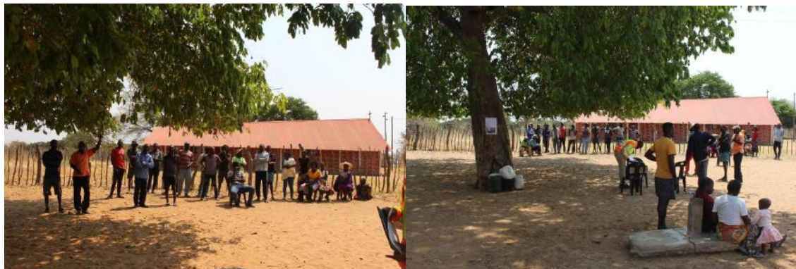
Figure 11: Community engagement meeting conducted

A public meeting was scheduled on Tuesday, 20 September 2022 at Diyogha settlement, and the meeting was well attended by all stakeholders. Appendix b has a detailed list of the attendance register. The consultant administered questionnaires during the meeting to all members who attended the meeting