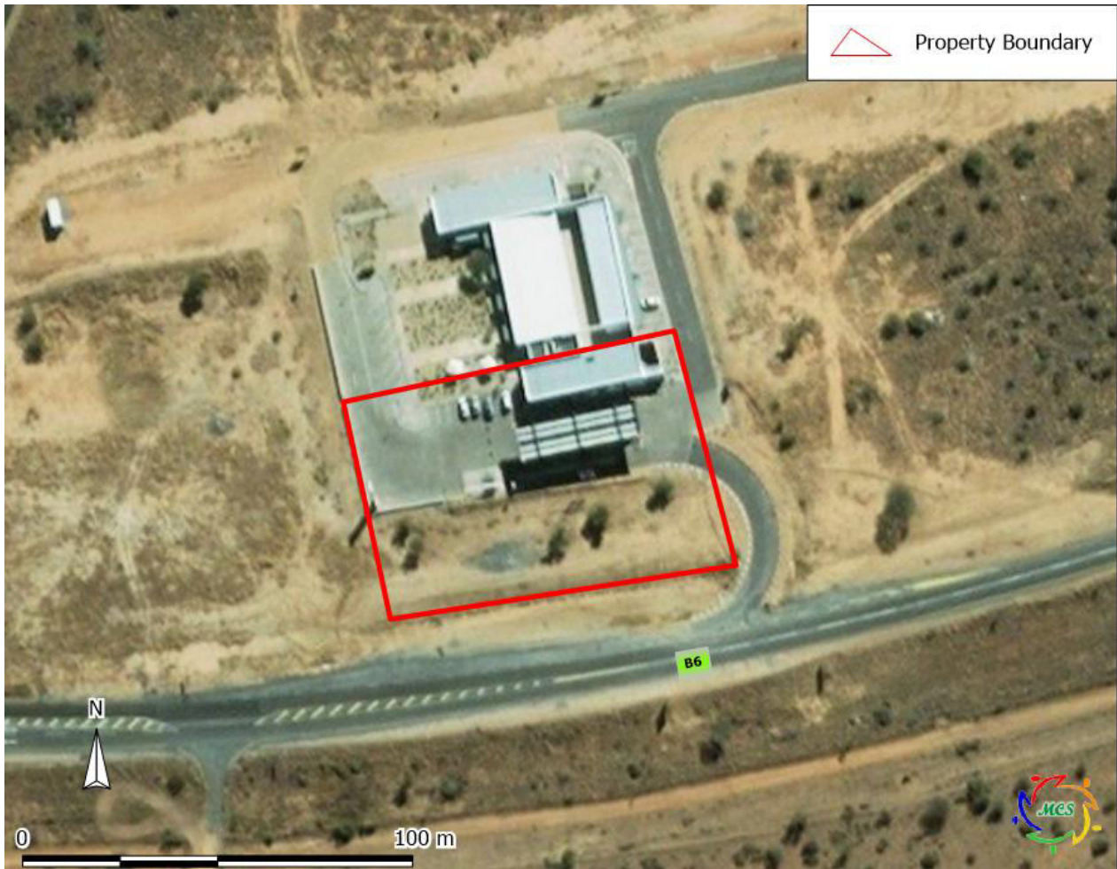
Figure 2. Layout of the site

Directly north of the site is a street, followed by undeveloped land. The land to the north is intersected by a railway track, thereafter the airport is located further north of the site. South of the site is the Trans Kalahari main road B6, followed by Etango Farm. East of the site is a street, followed by undeveloped ervens. Directly west of the site is undeveloped land (Erf no. 115), followed by the existing access road to the airport.