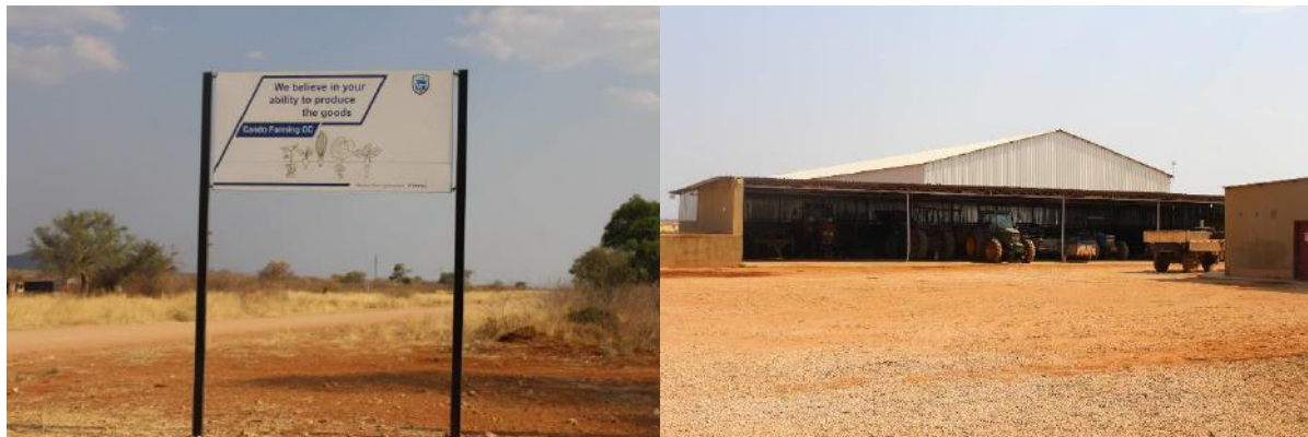
Figure 5: Cando irrigation Farm

Oshikoto Region is situated in the central-north of Namibia, south of Ohangwena Region and west of Kavango Region. It covers an area of about 38 685 km 2 . The region is divided into two parts with different land tenure systems: in the southern portion, large-scale farming units held under freehold title; and in the remaining portion, communal land governed by customary land tenure systems. However, private enclosure of land in the eastern and southern parts of the communal area has taken place for decades and is increasingly limiting access to land and natural resources for poor rural communities (e.g. the San). The northern part of the region is crop agriculture, whereas the main economic activities in the southern part are cattle rearing and mining. The two areas have important cultural and historical links in that the Ndonga people have extracted copper at Tsumeb since the earliest times in order to make rings and tools. Pearl millet (Mahangu) is the principal crop in the north, while cattle are reared in the Mangetti and the Tsumeb district. However, Giunas areas consist of commercial farms and tourist attraction areas such as lodges and the Guinas lake where water is abstracted for irrigation purposes.