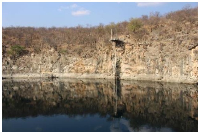
Figure 6: Guinas lake