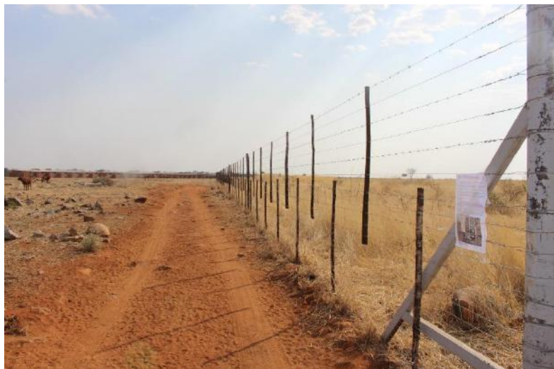
Figure 11: Site notice-Project site (New worker's quarters)