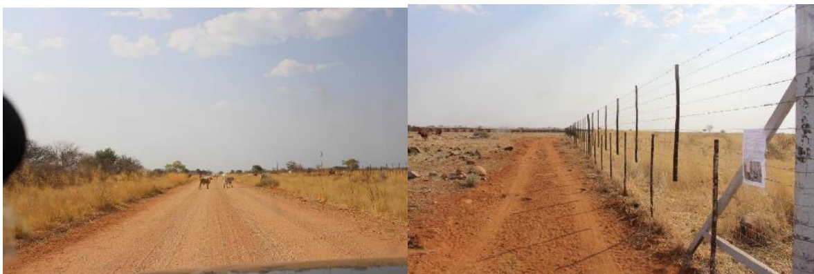
Figure 3: access road

The site is easily accessible from the D3031 gravel road.