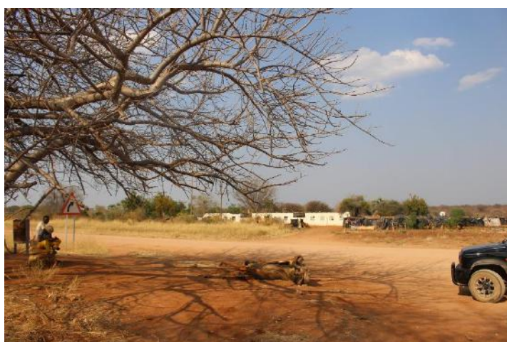
Figure 7: Workers' residence