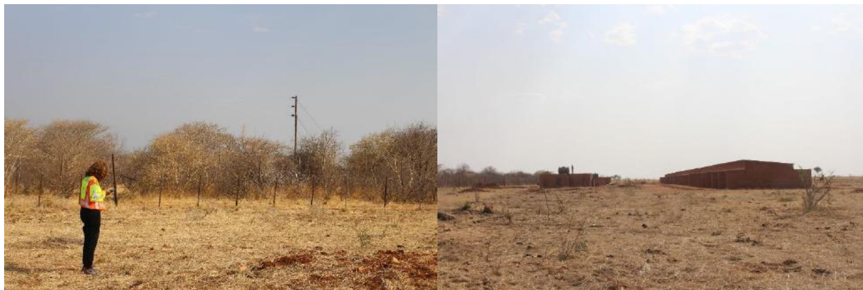
Figure 8: Project site

However, no plant species were present on the project site as the area has been cleared. Therefore the project will not have any impact on the flora.