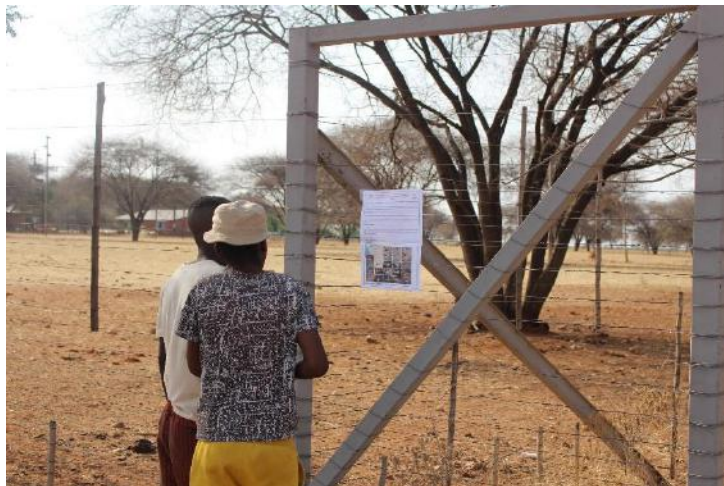
Figure 10: Site Notice-Condo Farm

A site notice was placed at Condo Farm and the new workers' quarters. These provided information about the project and related EA while providing contact details of the project team.