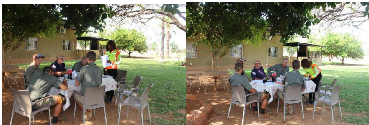
Figure 12: Community engagement meeting conducted

A public meeting was scheduled on Tuesday, 27 September 2022 at Guinas, Cando farm and the meeting was well attended by stakeholders. Appendix b has a detailed list of the attendance register. The consultant administered questionnaires during the meeting to all members who attended the meeting