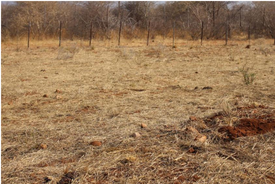
Figure 9: Pedology & Geology

Dominant soils prevailing in the Tsumeb area rock outcrops (representing the karst) with a band of Chromic Luvisols running approximately east to west through the area. Chromic refers to soils with bright colours and luvisols are a soil unit which only occurs (in Namibia) in two small areas west of Grootfontein, which have good water holding capacity and are well drained with a porous and aerated structure. Luvisols typically comprise an accumulation of clay that has settled some depth below the surface.