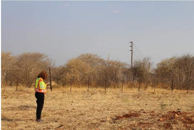
Figure 4: Powerline (outside project site)

Electricity: There is no existing electricity connection on site.