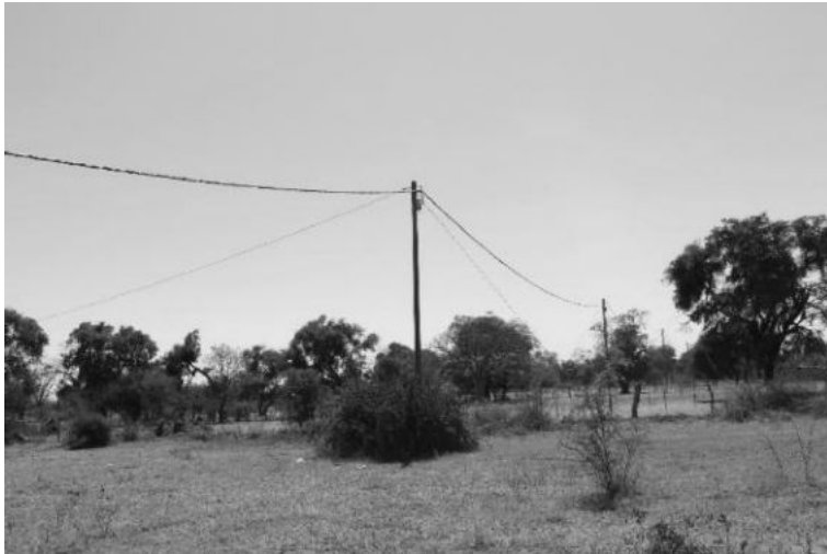
Figure 3: Powerline (Passing close to the project site)

Communication: The proposed project will provide for communication in the area.