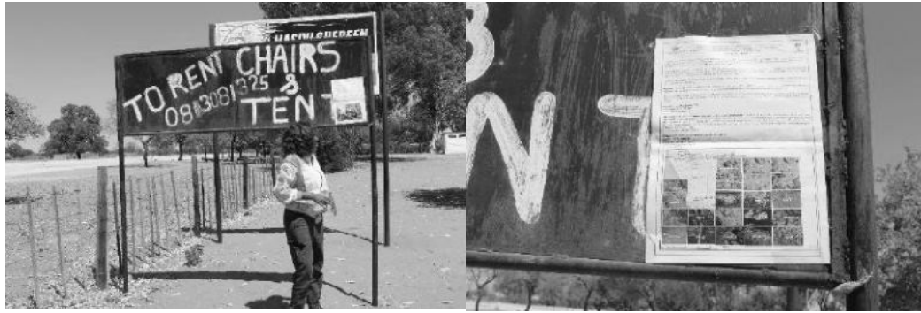
Figure 7: Site Notice – Headman Homestead