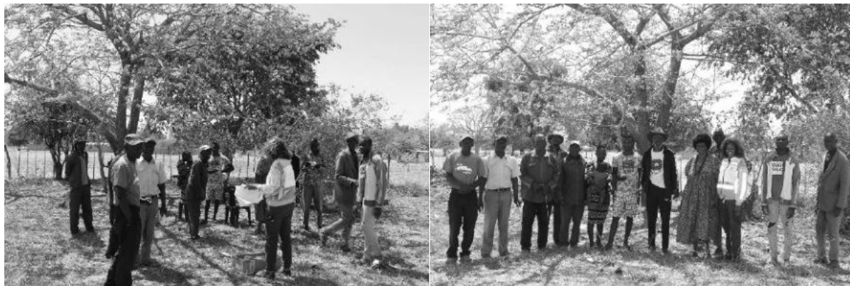
Figure 8: Community engagement meeting conducted

A public meeting was scheduled on Wednesday, 21 September 2022 at Mupini, and the meeting was well attended by all stakeholders. Appendix b has a detailed list of the attendance register. The consultant administered questionnaires during the meeting to all members who attended the meeting