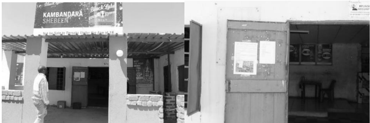
Figure 6: Site notice-Entertainment Establishment

A site notice was placed at an entertainment establishment and Headman Homestead. These provided information about the project and related EA while providing contact details of the project team.