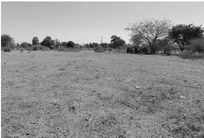
Figure 4: project site

However, most of these species are not present on the specific site as the area has been cleared or land degraded. No red data or endangered species were noted/ recorded during the site visit. therefore it was decided that it is not necessary to include an ecological specialist study in the report. But the removal of any vegetation in the surrounding area should still be done in a properly managed, planned and responsible manner to avoid the destruction of unnecessary ground cover or protected species. The rehabilitation of disturbed areas is important and should be done in accordance with the Environmental Management Plan (EMP) hence the project will have minimal impacts on the environment.