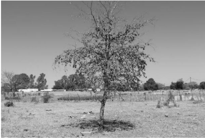
Figure 5: Terminalia sericea