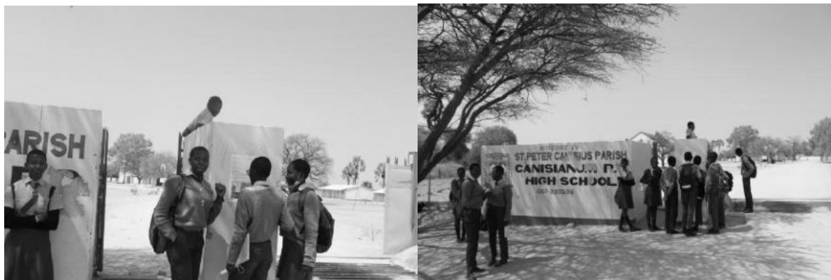
Figure 9: Site Notice- Canisiam High School

A site notice was placed at the Canisiam High School. These provided information about the project and related EA while providing contact details of the project team.