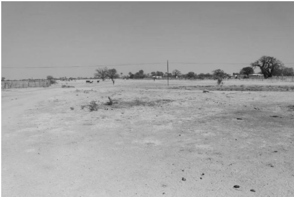
Figure 7: Project site

However, most of these species are not present on the project site as the site is degraded and is dominated by grass that has been browsed on. In the surrounding Hyphaene petersiana is the dominant tree specie. Therefore, there will be no impact on flora.