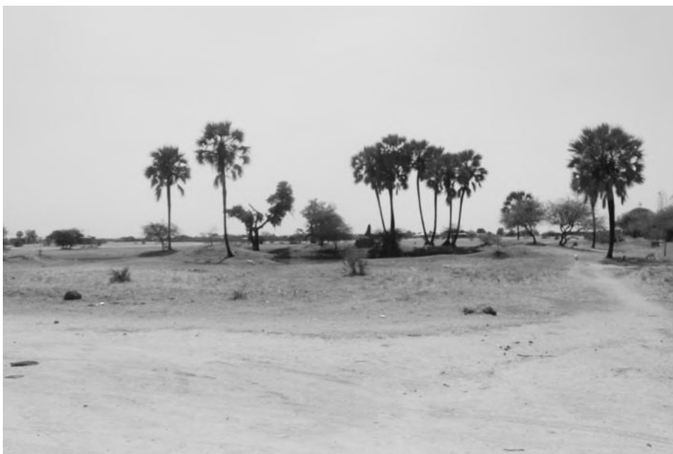
Figure 8: Hyphaene petersiana