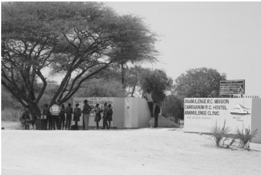
Figure 5: Canisian High school

Omusati Region is predominantly an agricultural Region, focusing on both crop and livestock farming. This is due to its fertile soil and the availability of water from the water canal. Among other crops, omahangu is successfully cultivated and consumed as a staple food. Apart from the said activities, local people also engage in subsistence farming such as livestock and crop production or small-scale farming. Passed on from ancestors, weaving traditional baskets is one of the major activities which take place in the Region. The baskets are used to carry omahangu when people pound, while others are also used as handbags or hats. The community, mostly women possess adequate skills in how to make pots and bowls from the mud. They are processed underground by making a hole in the ground with a very small entrance to prevent a lot of air which might cause the cracking of pots. The baskets and pots are sold in some homesteads to make a living. The area consists of a school, business establishment area, clinic, and homesteads with crop fields and kraals for their domestic animals.