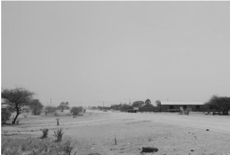
Figure 6: Business establishment area