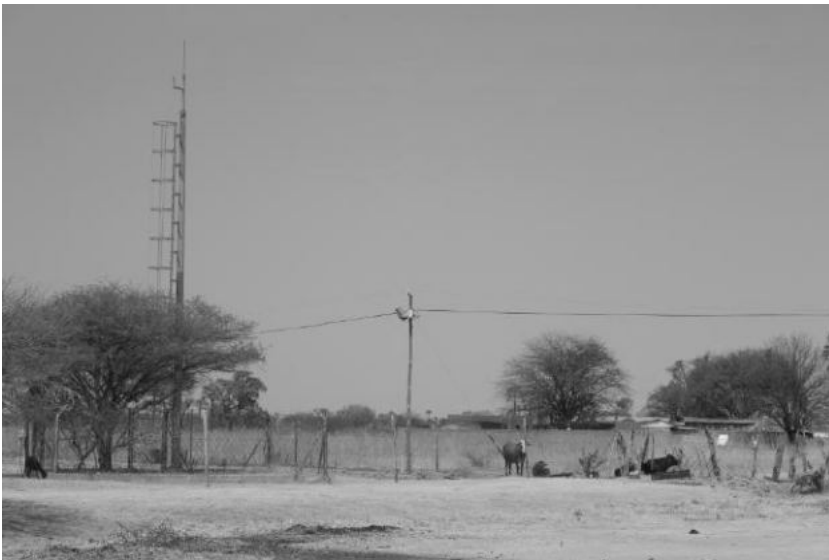
Figure 4: Powerline

Electricity: There is no existing electricity connection on site, however, there is an electric box close to the site.