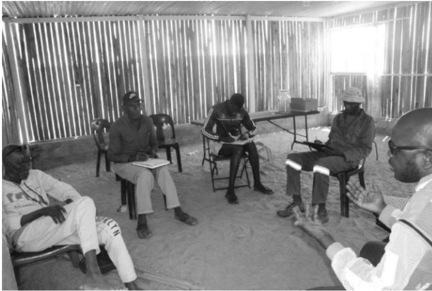
Figure 10: Community engagement meeting conducted

A public meeting was scheduled on Friday, 23 September 2022 at Anamulenge, and the meeting was attended by stakeholders. Appendix b has a detailed list of the attendance register. The consultant administered questionnaires during the meeting to all members who attended the meeting.