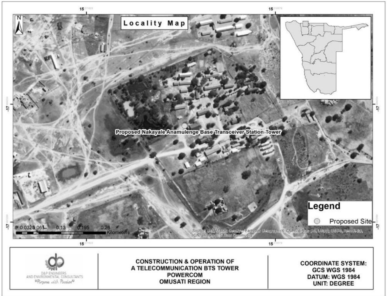
Figure 1: Site Locality