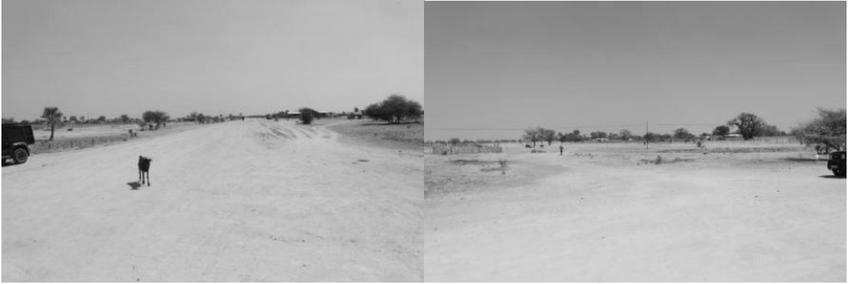
Figure 3: Access road