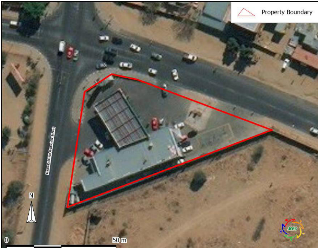
Figure 2. Layout of the site

Directly north of the site are residential properties. East of the site is a football sports field (recreation). South of the site is an open erven. Jan Jonker Afrikaner School is situated to west of the site. Land use in the area is mainly residential / commercial. The fuel retail facility occupies an approximate land size of 5,000m 2 . Land use in the area is classified as commercial.