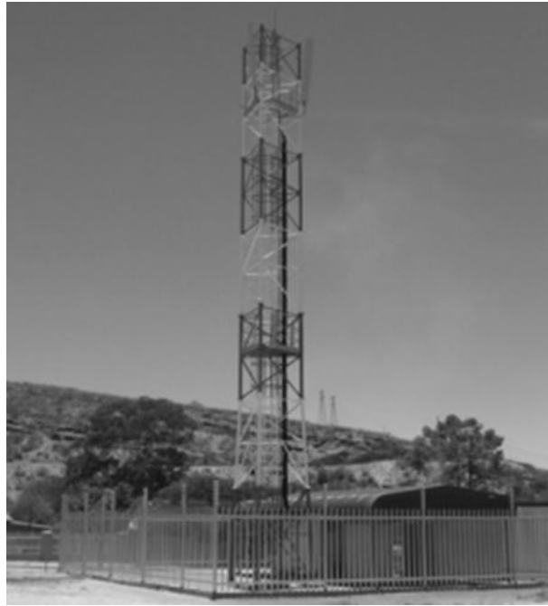
Figure 2: Typical telecommunication towers structure and form (visual purposes only)