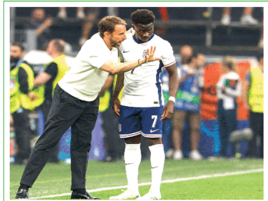
ENGLAND VS SPAIN... England overcame the Netherlands in a spectacular 1-2 victory on Wednesday night to advance to the Euro 2024 final on Sunday where they will meet Spain, who beat France 2-1 in the other semi-final on Tuesday.

CALL THE SPCA ON: 061 238645 OR 0811244520 DONATIONS: SPCA Windhoek FNB Account: 62247995915 Code: 281174