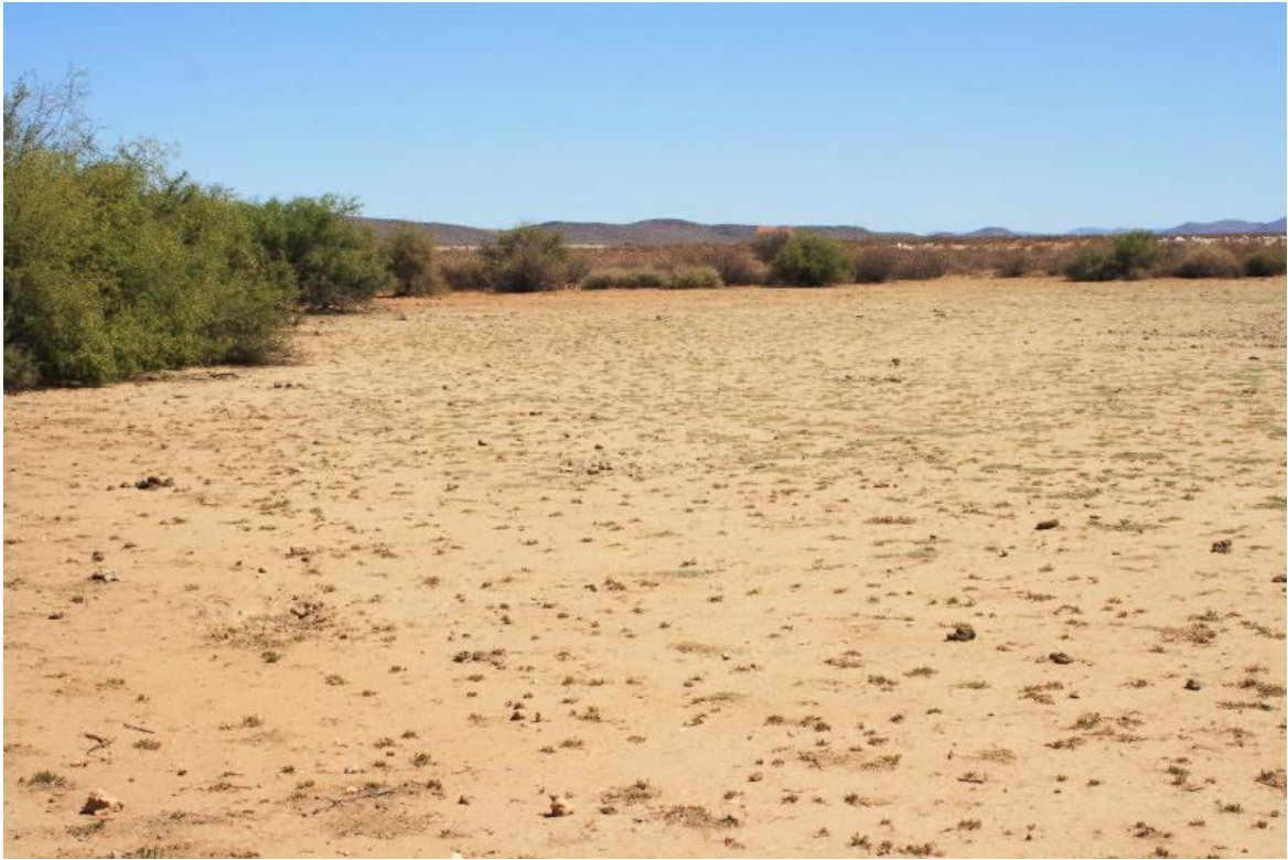
Figure 3. Well vegetated, ephemeral pans are viewed as sensitive (“high”) habitats.