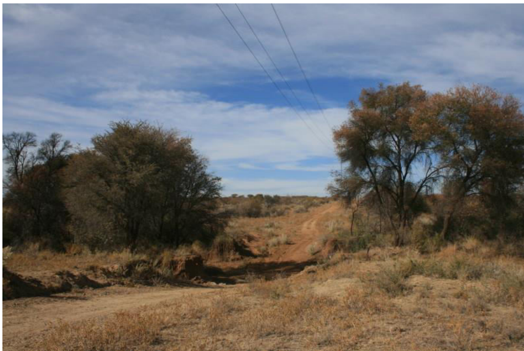
Figure 2. Drainage lines viewed as “high” sensitive area

The route passes through “hotspot” classified as “high” and “medium” sensitivity, respectively (figure 2 - 8). The areas of “high” sensitivity are viewed as the various larger ephemeral drainage lines (including the Seeis, White Nossob and Black Nossob Rivers); farm dam, pan and rocky areas