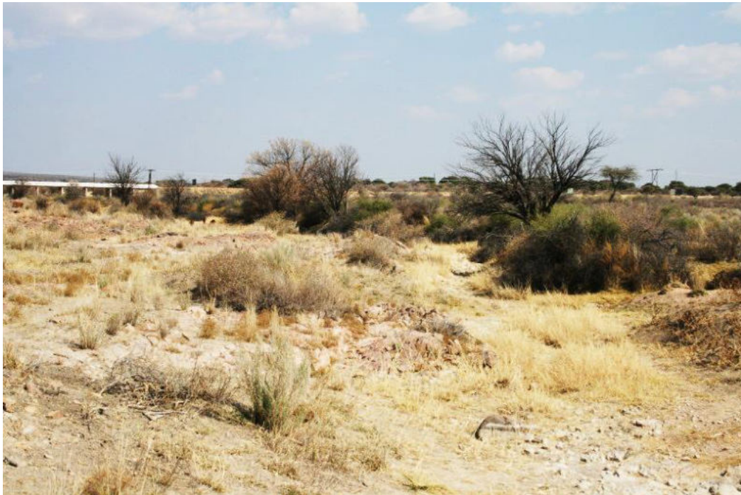
Figure 7. The important Black Nossob River (“high” sensitivity)