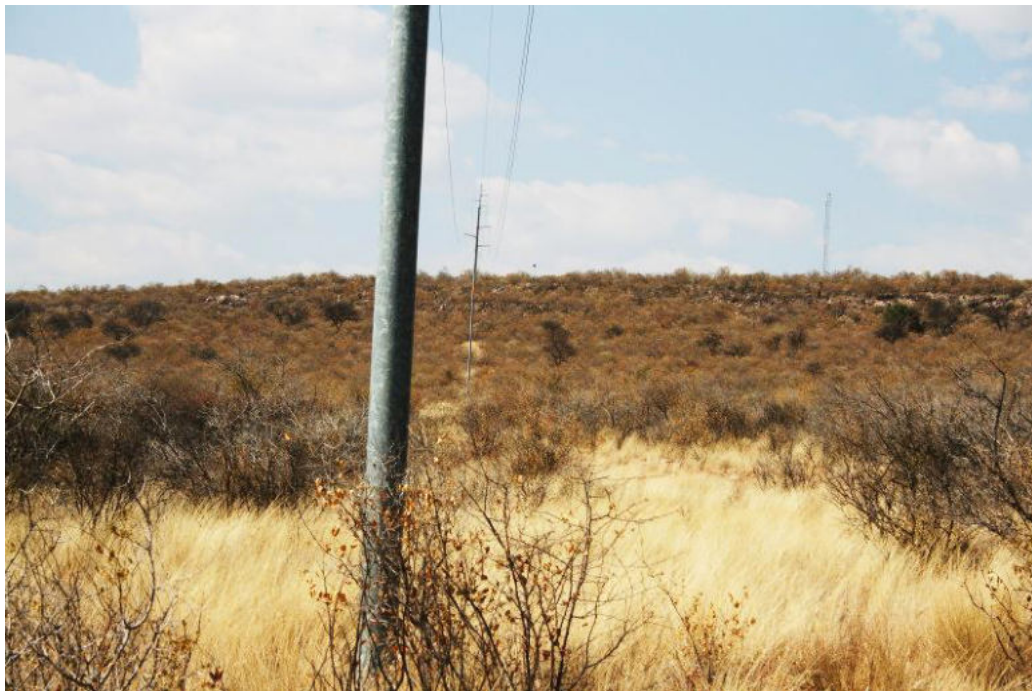
Figure 8. Rocky hill area on the outskirts of Gobabis viewed as “high” sensitive area