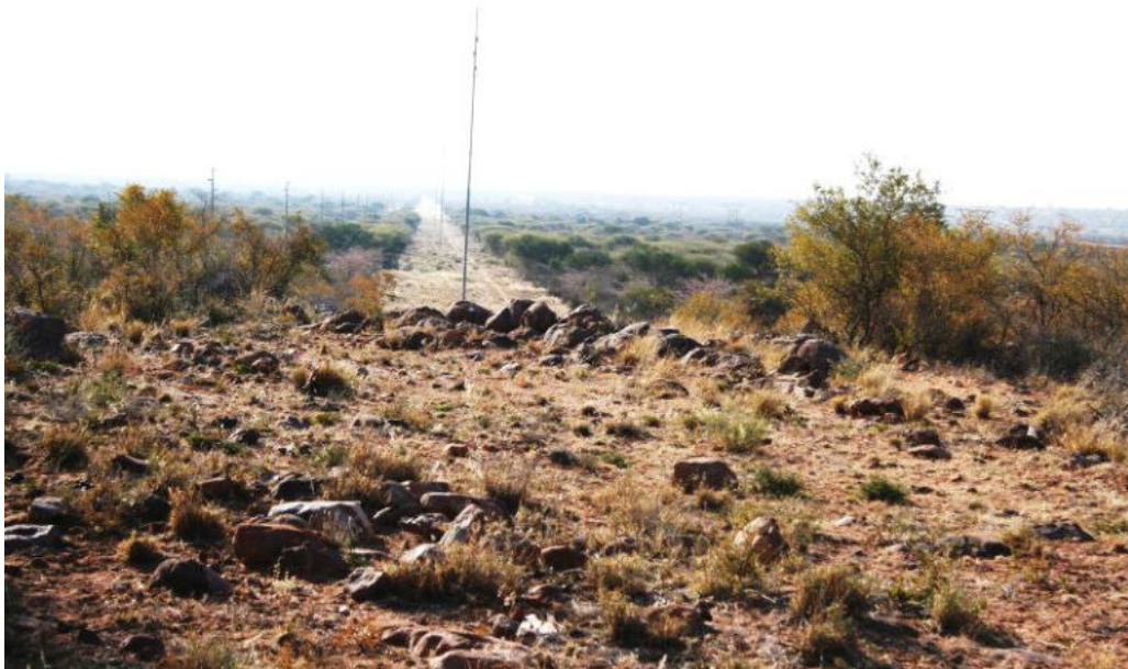
Figure 6. Rocky area in the Witvlei area viewed as “high” sensitivity