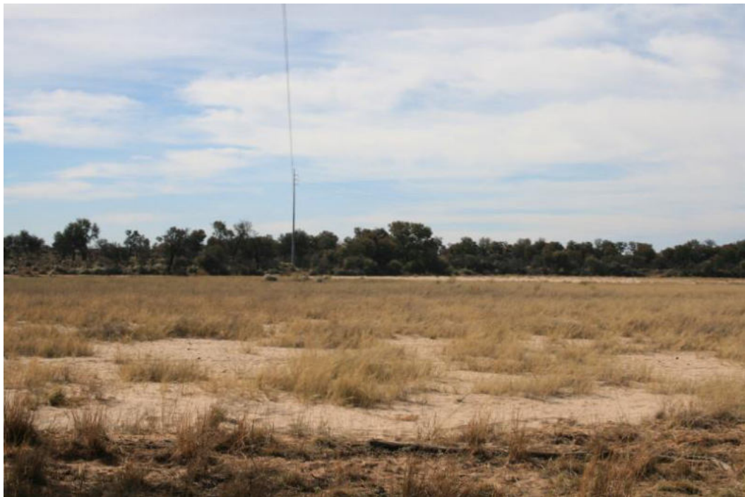
Figure 4. The Seeis River is viewed as another “high” sensitive area.