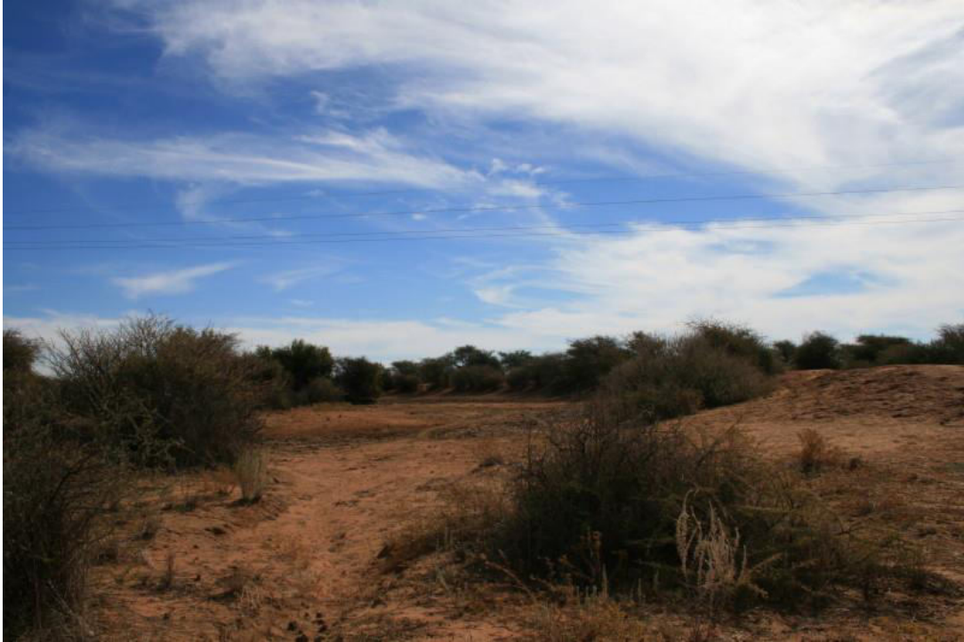
Figure 3. Farm dam viewed as “high” sensitive area