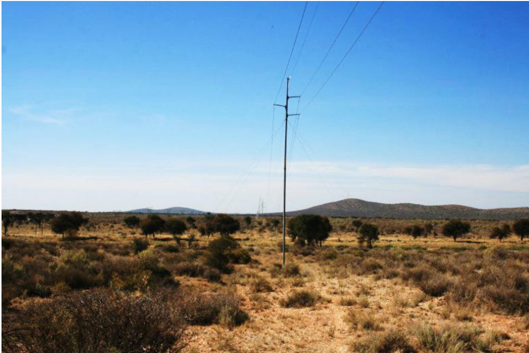
Figure 5. The White Nossob River viewed as “high” sensitive area