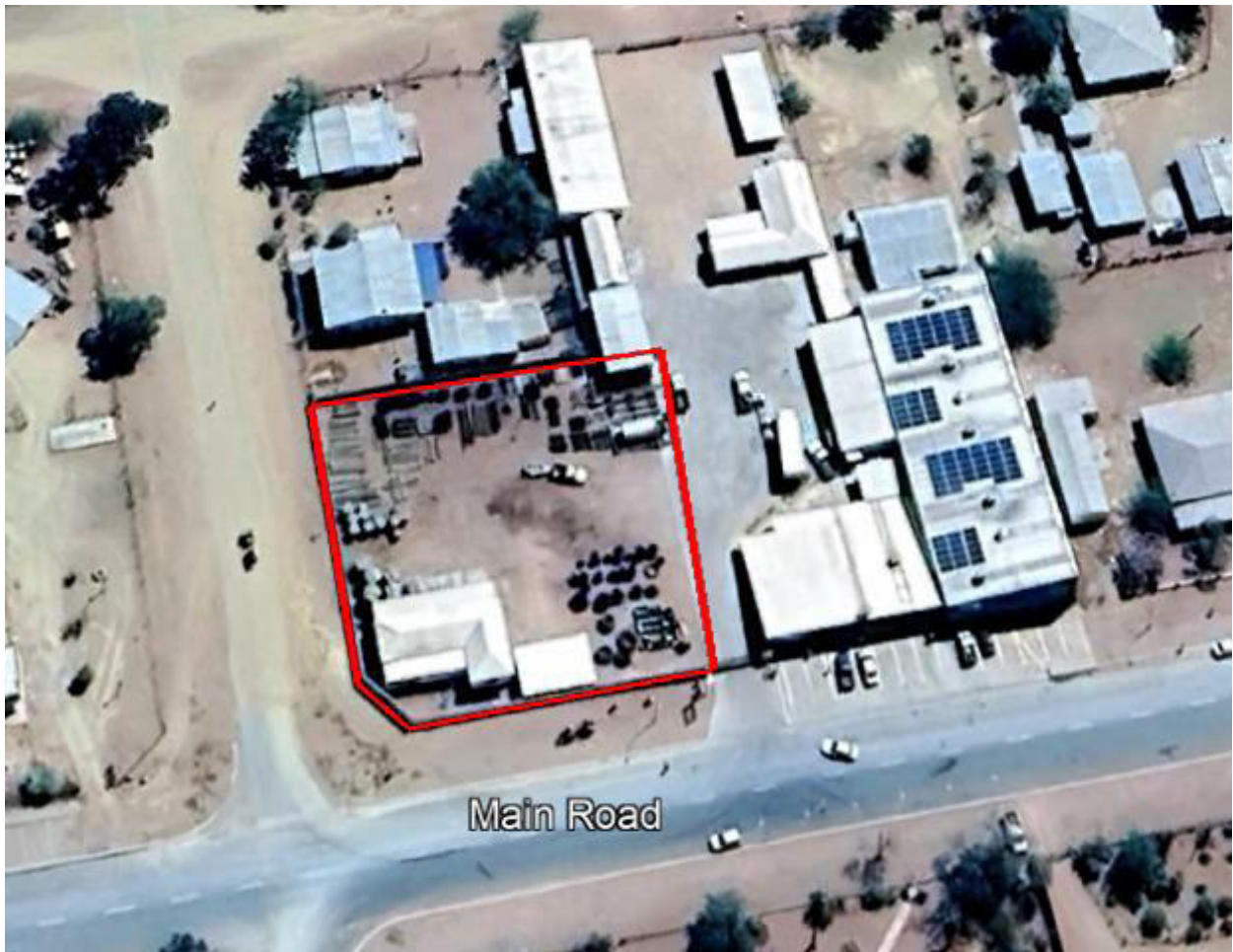
Figure 2. Site layout map