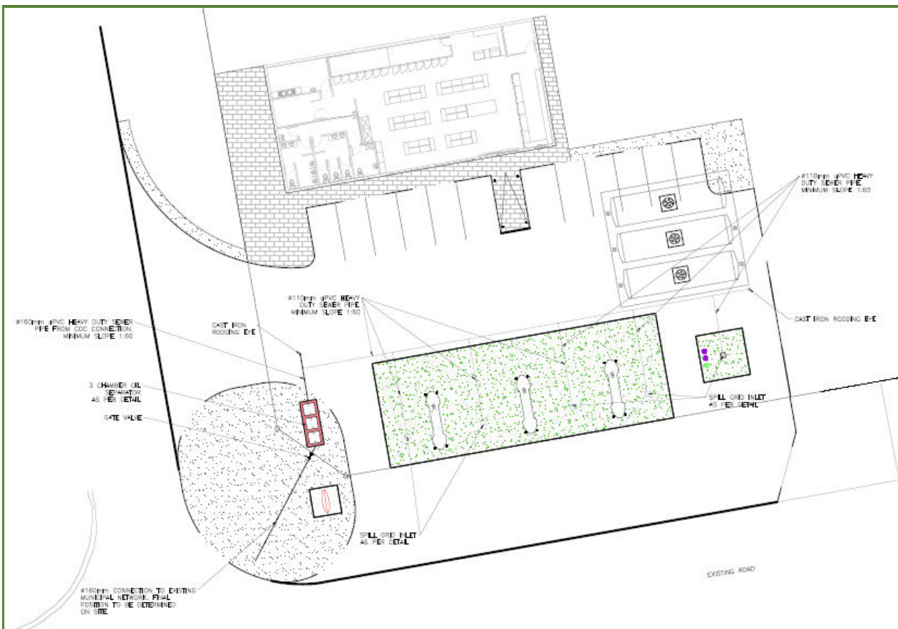
Figure 3. Proposed new site layout plan

The upgrade and fuel storage alterations at the facility will be constructed and operated according to relevant SANS standards (or better), with special emphasis on SANS 10089:1999, SANS 100131:1977, SANS 100131:1979, SANS 100131:1982, SANS 100131:1999.