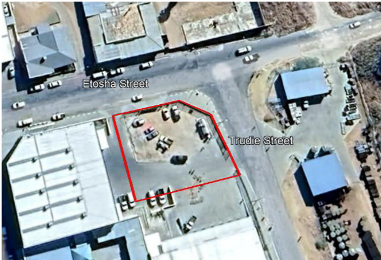
Figure 2. Site layout map